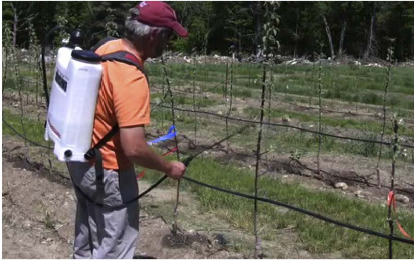
Figure 3. BA (375 ppm) was applied by backpack sprayer between 30 and 50 inches from the soil surface soon after planting.

notching) and BA application (with or without) in two locations (Massachusetts and New Jersey) soon after planting in the orchard. The control was not headed or notched. The heading treatment (Figure 1) cut trees to approximately 40 inches in height shortly after planting. For the notching treatment (Figure 2), 10 buds between 30 and 50 inches from the soil surface were notched with a hack-saw blade also shortly after planting. For trees receiving BA, Promalin® Valent U.S.A., Figure 3) was applied to the leader (30 and 50 inches from the soil surface) using a backpack sprayer at