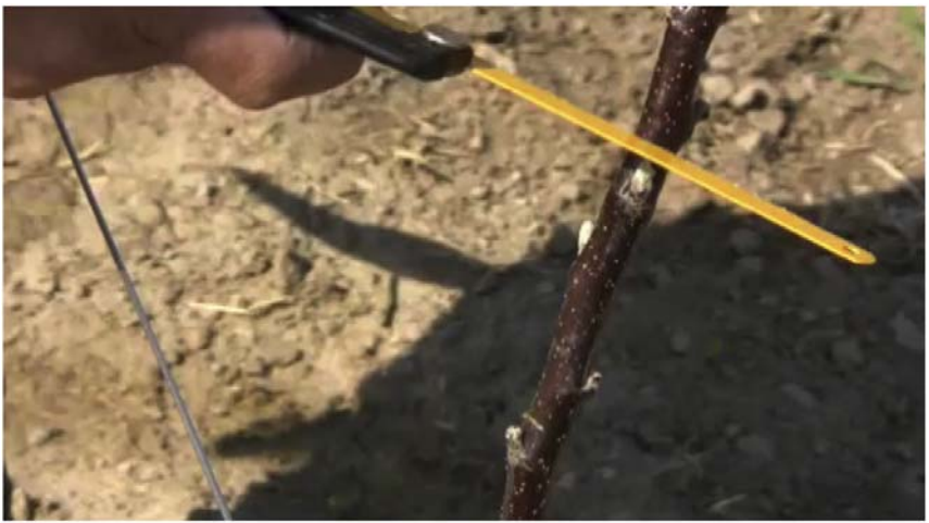
Figure 2. Notching was performed with a hacksaw on 10 buds between 30 and 50 inches from the soil surface soon after planting.

When planting high-density apple orchards on dwarf rootstocks, it is best to use well branched nursery trees so that early production and profitability are maximized. Often, however, nursery trees arrive with less than the optimum number of branches, or worse, are nearly ‘whips’ with no branches at all. Hence, steps are often taken to promote branching. In semi-dwarf orchard systems at wider spacing a heading cut is very effective at creating branches, however, may have an invigorating effect