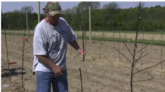
Figure 1. For the heading treatment, trees were cut 40 inches from the soil surface soon after planting.

that is not necessarily desirable in high-density orchards. Bud ‘notching’ and benzyladenine (BA) application are two other methods to promote branching in young trees.