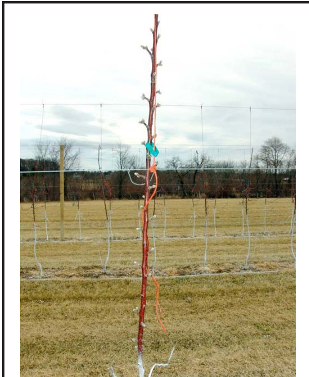
Figure 4. Untreated tree after one season.