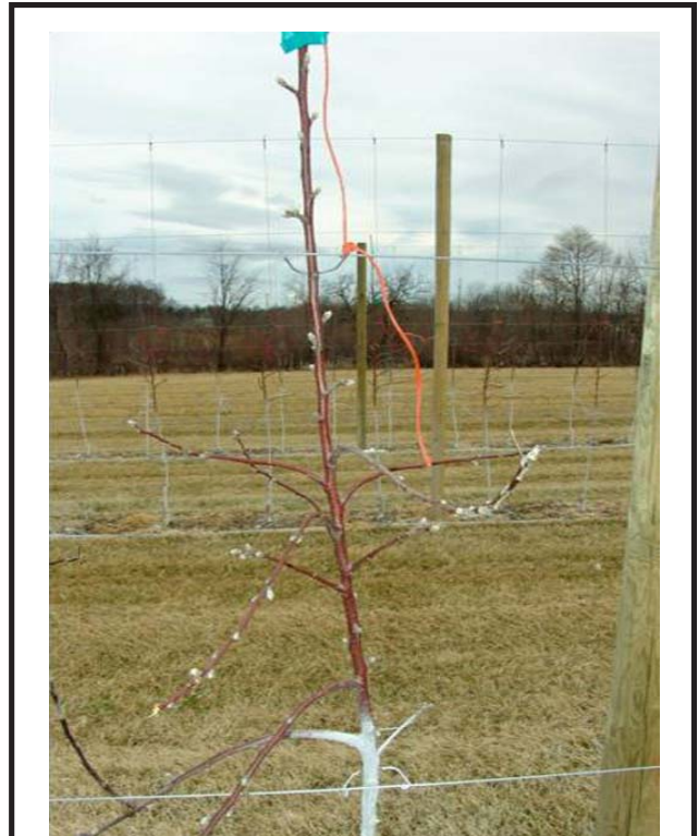
Figure 5. Notched tree after one season.