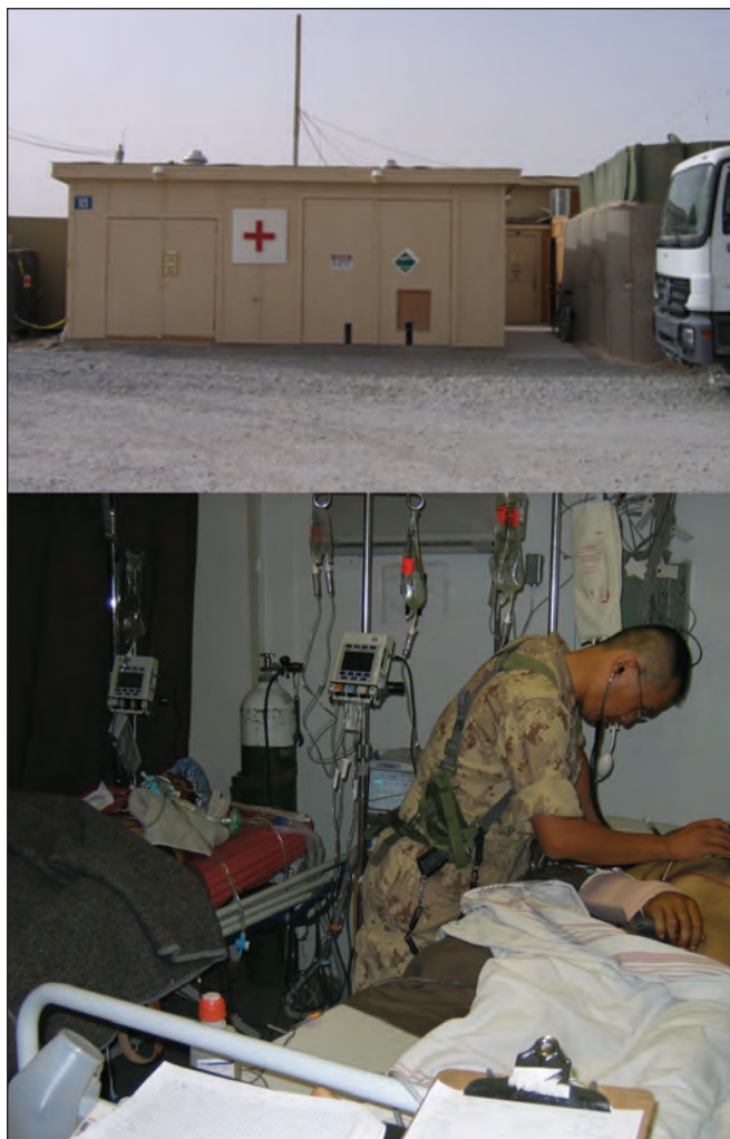
Fig. 1. The Role 3 Multinational Medical Unit facility in Kandahar, Afghanistan.

In early February 2006, Canada established the