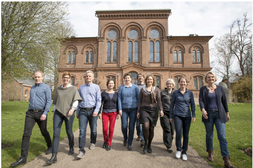
eHealth core group at the Pufendorf Institute. (Tomas Kirkhorn not in photo)

In our final contribution eHealth and the digital reinvention of healthcare Martin Stridh discusses how the healthcare system can adapt to and make use of the momentum of the health initiatives in the private sector. He looks in particular at the importance of a planned integration of the private health market into the healthcare system.