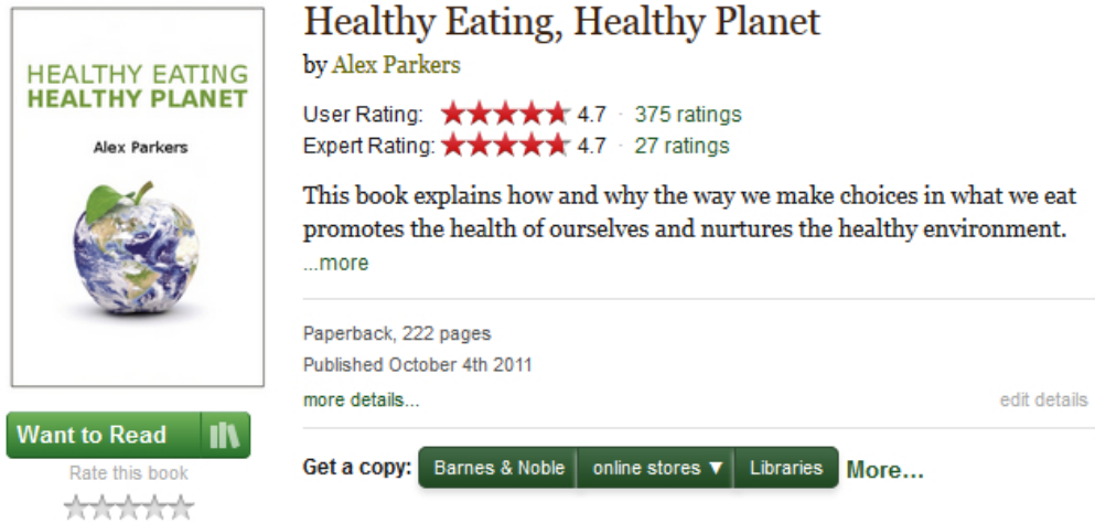
Figure 1: Example stimulus page

originals. All other elements, including one image for each screen were held constant (See Figure 1 for a screen shot).