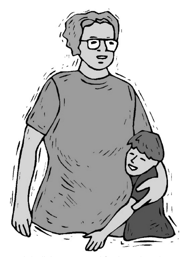
Include all the caregivers and family members who are involved with the child's care and education.

14. Use regular conferences to establish a collaborative home–school relationship. Conferences may inform the