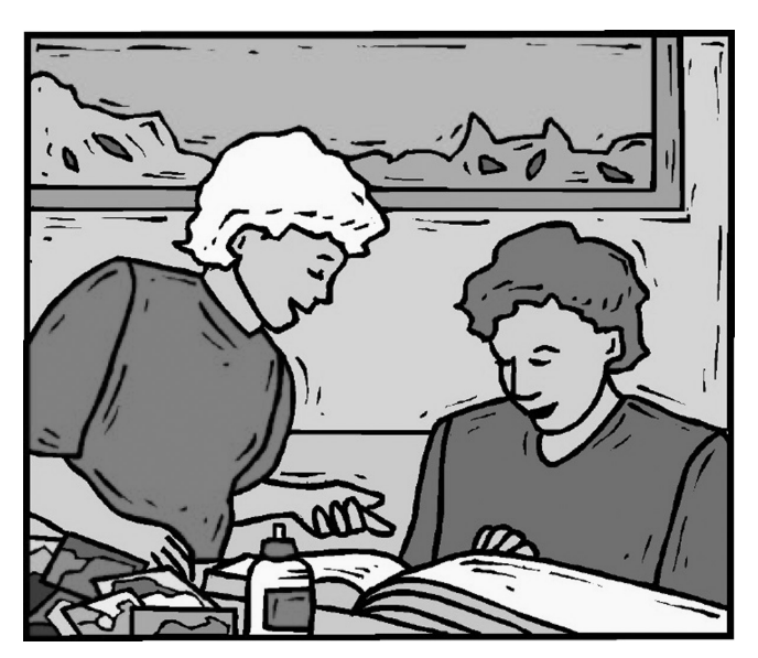
Encourage families to teach their children how to develop friendships.