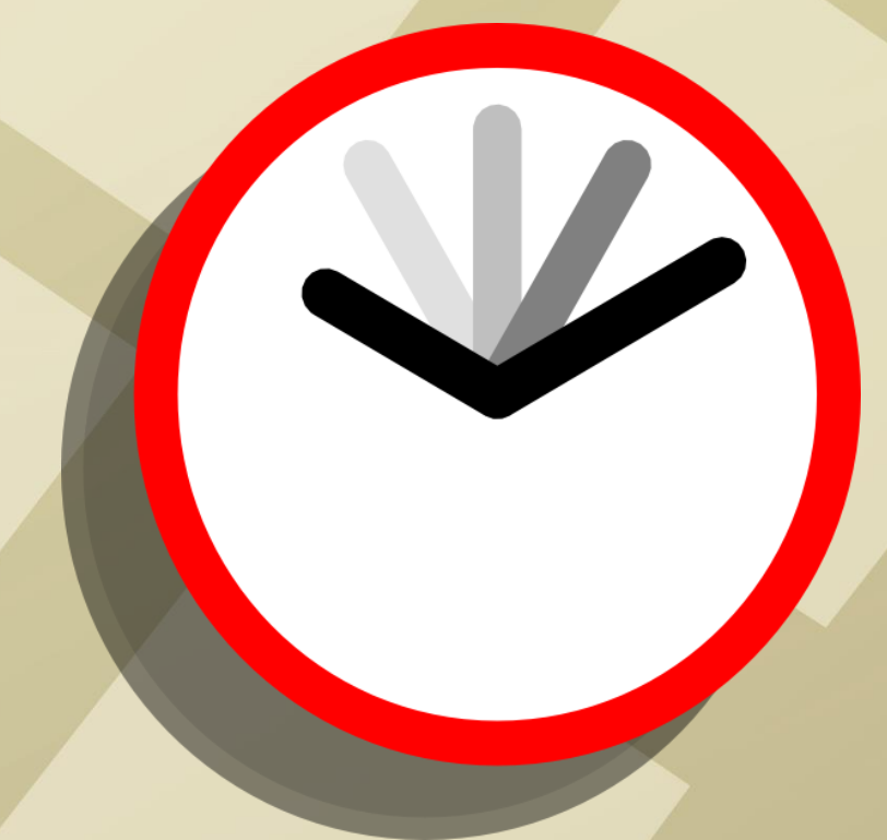
Figure 1: Comparison of length of stay

The observation unit was successful in reducing and sustaining the reduction in patient's LOS. This was accomplished as a result of collaborative inter-professional approach sustained throughout the pilot project.