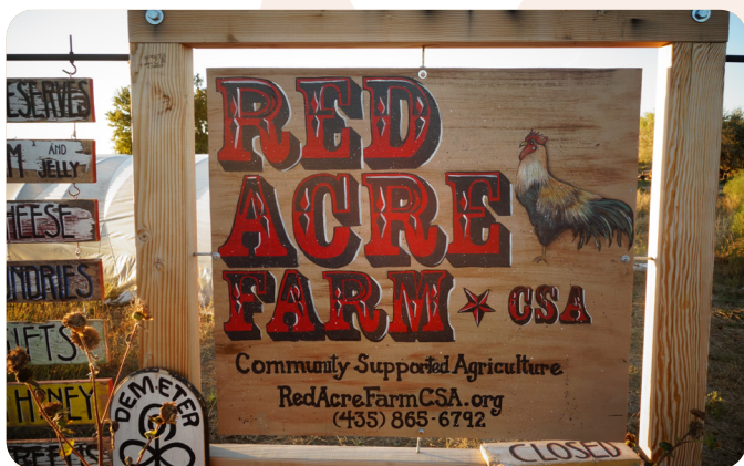
Red Acre Farm CSA in Cedar City, Utah.

the land and operation. Without the need of relocation, you can also create and maintain a constant tie to the local community and shareholders. A potential barrier would be the cost of land.