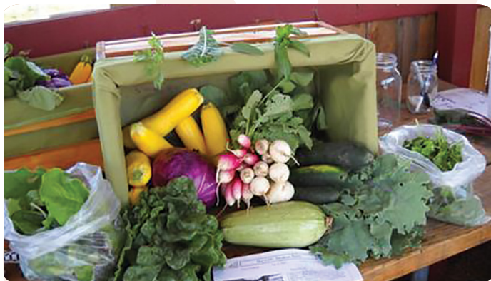
CSA Share Example.

Determining the Share Size: Many CSAs offer a full-size share or half-size share to shareholders. A full-size share should provide enough food for a family of four throughout the week (CSA Utah, n.d.). Full-sized shares are intended for more than two people, are priced at a higher rate, and are either delivered more often to shareholders or with more produce per share. A half-sized share is intended for two people.