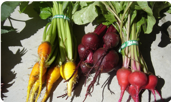
Vegetables can be bundled for distribution.

The pickup location would benefit from a sign telling shareholders how much of which produce they should take home. Shareholders could also trade produce with each other to cater to their personal taste. Youth Garden Project's CSA in Moab, Utah, allows shareholders to leave any produce they will not use in a designated basket, and others are able to take this produce if they wish when they pick up their shares. If you choose to offer pick up in bulk