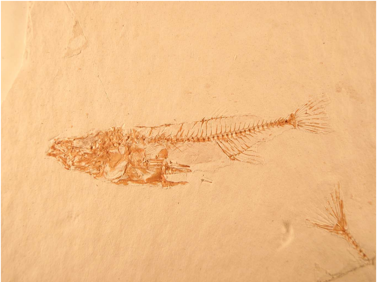
Figure 3. Developing genetic and evolutionary tools for taxa with an extensive fossil record will be an important means of integrating the study of evolutionary pattern and process. Genomic sequence data for stickleback fish is now providing insight into evolutionary patterns, such as the reduction in the pelvic skeleton, manifest both in the fossil record and in extant populations [83].