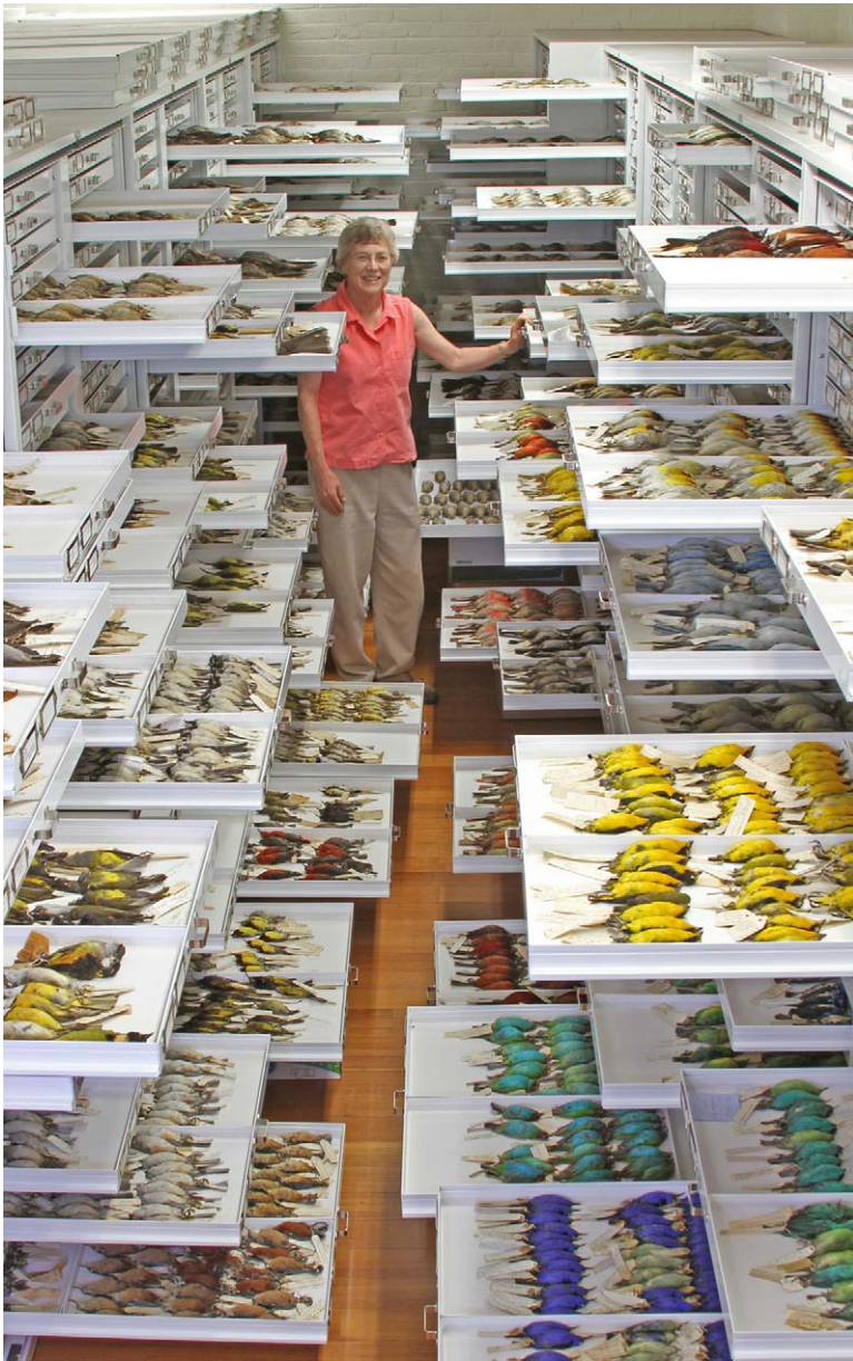
Figure 2. Natural history museum collections are tremendous repositories of specimens and data of many sorts, including phenotypes, tissue samples, vocal recordings, geographic distributions, parasites, and diet. doi:10.1371/journal.pbio.1001466.g002

widespread occurrence of lateral gene transfer. However, the phylogeny of these organisms and their genes remains critical to understanding their scope, origins, distributions, and change over time [92]. The advent of metagenomic sequencing of environmental microbial communities has revealed greater diversity and flux of genotypes than ever imagined, defying conventional species concepts and presenting a major challenge to applying traditional evolutionary and ecological theory to understanding microbial diversity