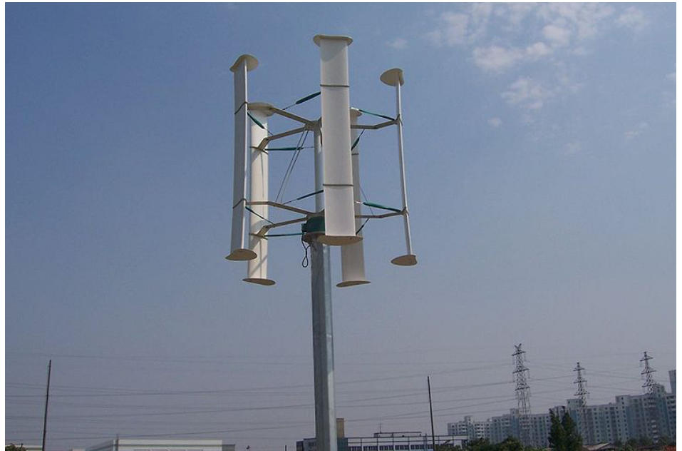
Figure 2: A Modern H-Rotor Darrieus Wind Turbine

Because VAWTs can intake wind from any direction, they can operate in turbulent and variable wind conditions far better than HAWT designs (Berry, 2009). In fact, VAWTs can often operate in higher wind speeds than their HAWT counterparts which equates to greater energy generation under these conditions. These advantages have led both designers and politicians to consider adding VAWTs to urban environments (Ragheb, 2008). VAWTs often have their gearbox and electrical alternator located near the ground which facilitates easier maintenance. Some new VAWT designs have a coefficient of performance approaching 0.40 and allow for greater turbine density per parcel of land (Allan, 2007). Marsh (2005) notes that new H-rotor VAWT designs may also break the 10 MW barrier as the orientation of the blades coupled with modular manufacturing techniques allow VAWTs to be constructed larger than HAWTs. However, there are reasons why VAWTs have not seen more widespread use in wind farms.