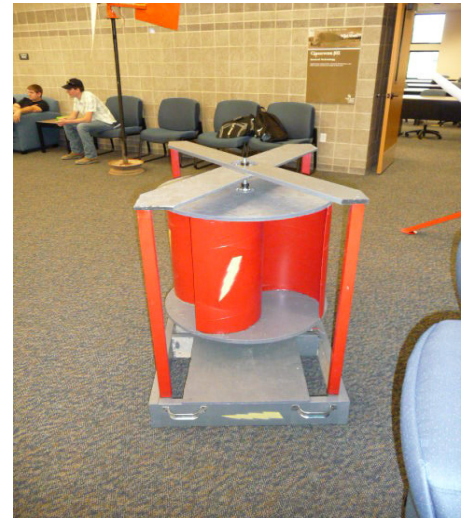
Figure 1: A Homemade Savonius Wind Turbine

generally less than 1. Figure 1 shows a student built Savonius wind turbine.