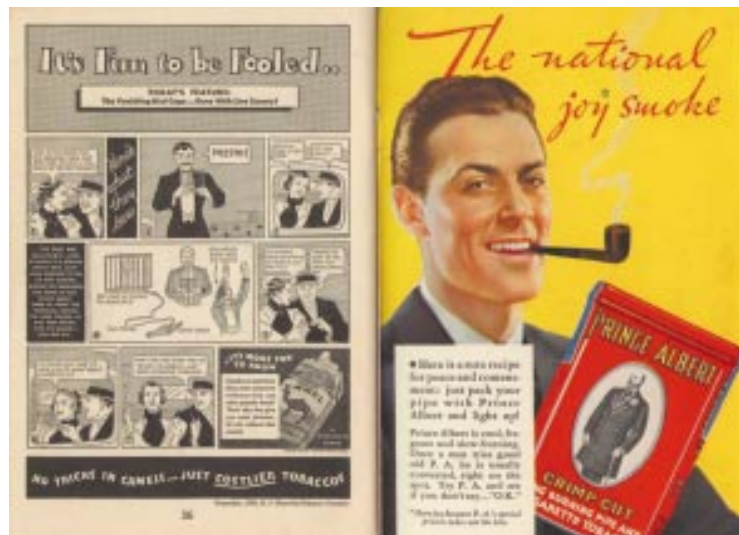
And here are some other tricks we didn't find in the book. Light up, and watch people leave the room. Works every time! Ask a tobacco executive to tell you what "cause" means... wait an hour, and now try and untie the verbal knot he creates. Bet you can't!"