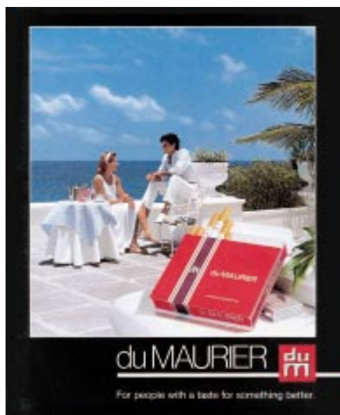
Figure 4 Exhibit 4: duMaurier aspirational lifestyle (Greek ocean side holiday).

understated activity, which makes the smoker inconspicuous and less prone to social censure . . . These attitudes result in smokers requiring some reassurance about both the social acceptability of smoking [and smoking a particular brand] . . . TEMPO's advertising does not seem to have given this support . . . and the brand's visibility may make it a little uncomfortable for smokers . . . TEMPO's advertising is seen as: (a) highly intrusive [for example, all over the place, highly colourful, pushy], which may be too visible for comfort; (b) youth oriented [for example, for teenagers, people under 25, new smokers] . . .; (c) lacking identity with the target groups . . . appear to have few redeeming qualities except an interest in fashion and trends." Put briefly, it seems that TEMPO's advertising was too trendy and heavy handed in its style and deployment, becoming transparently interested in a youthful market. This backfired because adolescents are decidedly disinterested in symbols of adolescence, wanting symbols of the adulthood they aspire to. 44