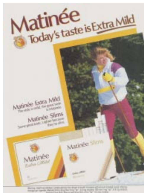
Figure 6 Exhibit 6: Matinee "Picture of Health" (cross country skier)

The "Vantage family copy strategy and platform" stated the brand's psychological "benefit" in terms of being seen as intelligent (fig 5). "Vantage smokers will be perceived as being intelligent urban adults who enjoy or aspire to a progressive cosmopolitan lifestyle. Moreover, their cigarette brand will be viewed as the only contemporary choice for intelligent smokers. As intelligent individuals, they will be seen as self confident, career oriented socially active and cosmopolitan in their outlook on life". 71