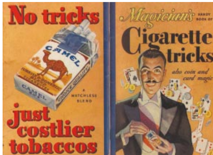
Yes, indeed. It's fun to be fooled by Camel... by not being told about carcinogens, that there's a small problem about lung cancer after years of use, and quite a few more things besides.