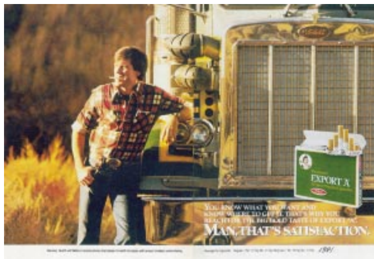
Figure 2 Exhibit 2: Export A rough blue collar imagery (trucker).

"Very young starter smokers choose Export A because it provides them with an instant badge of masculinity, appeals to their rebellious nature, and establishes their position amongst their peers. As they mature, they gain more confidence . . . acquire other symbols of their masculinity . . . and strive for social and peer group acceptance . . . Export A is declining in its ability to hold the young adult males as they go through the maturing process, due