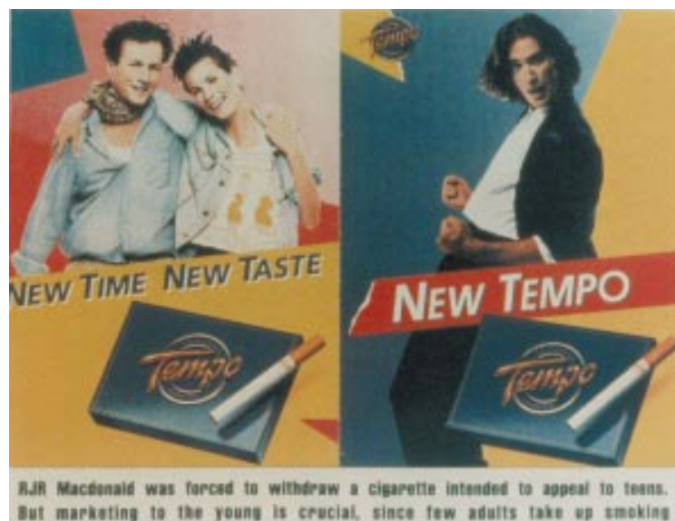
Figure 3 Exhibit 3: TEMPO peer group support (reciprocated shoulder hugs).

RJR-M began their evaluation research in December 1985, when the product had been on the market for only a few weeks. The results were mixed, and not entirely encouraging. “The present anti-smoking climate has made smokers defensive about smoking both to themselves and others. This has resulted in a preference for smoking to be a relaxing,