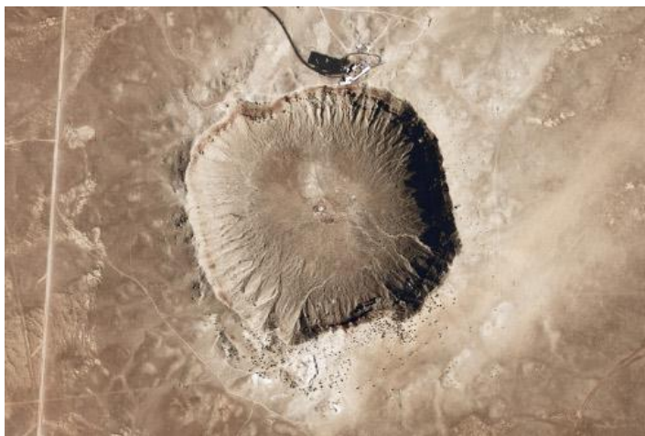
Figure 1: Satellite image of Barringer or Meteor Crater, Arizona U.S.A. The dark rectangle at the top is a museum. ( http://earthobservatory.nasa.gov/IOTD/view.php?id=39769 )

As terrible as these impacts were, none of them left craters. According to the Earth Impact Database (PASSC, 2015), there are almost 200 verified craters on Earth's surface from even bigger impacts, almost none of which occurred during recorded human history. Oddly, most of them were not identified as impact structures until the late 20 th century. Geologists generally attribute features like craters and canyons to events we can see taking place today or in recorded history, like erosion by rivers, gradual movement of rocks on either side of a fault by earthquakes over time, volcanic eruptions, etc. Craters