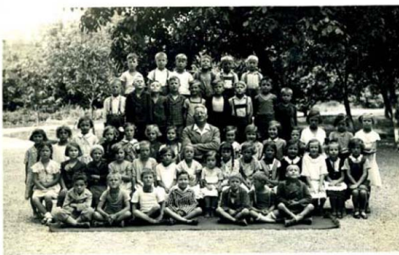
First grade in 1934 end of school year (20),