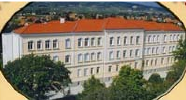
Elementary School, Traiskirchen (18);