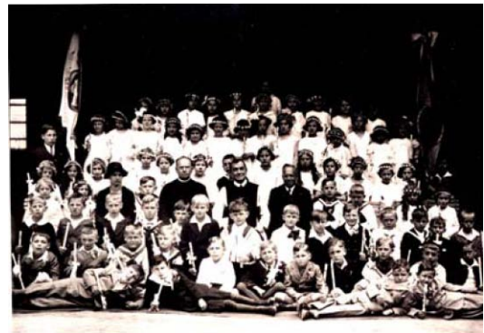
First grade, first communion (19)