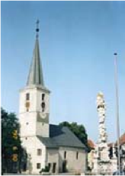
Church St, Nikolaus (16):