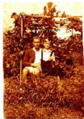
Artist drawing: Luydererstrasse, mid 1930's (11); OV with local boys, 1931 (12)