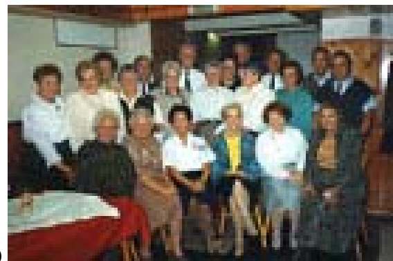
70 years later (21)