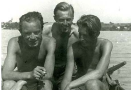
On a lake in Carinthia, 1947 (32)