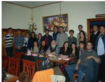
DINNER WITH PROFS

a great night that many of us will never forget.