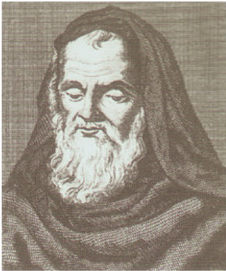
Roger Bacon (1268)