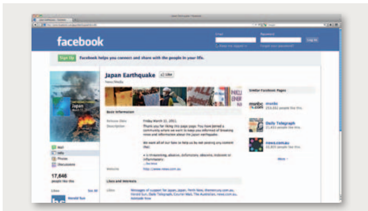
Social media such as Facebook and Twitter have been used extensively by emergency service agencies.

A major weakness of engagement and education activities and programs delivered by Australian emergency agencies is lack of evaluation. The National Review of Community Education, Awareness and