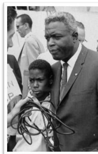
Photograph, Jackie Robinson and son being interviewed at the March on Washington, August 28, 1963