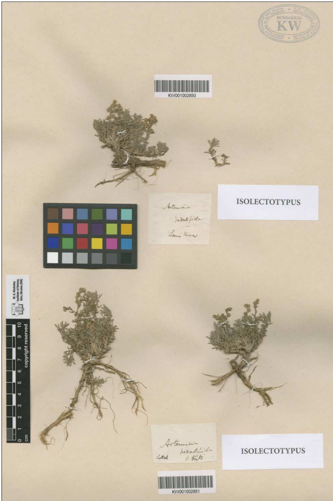
Figure 9. Isoelectotypes of Artemisia pedatifida Nutt. (KW001002850 and KW001002851).