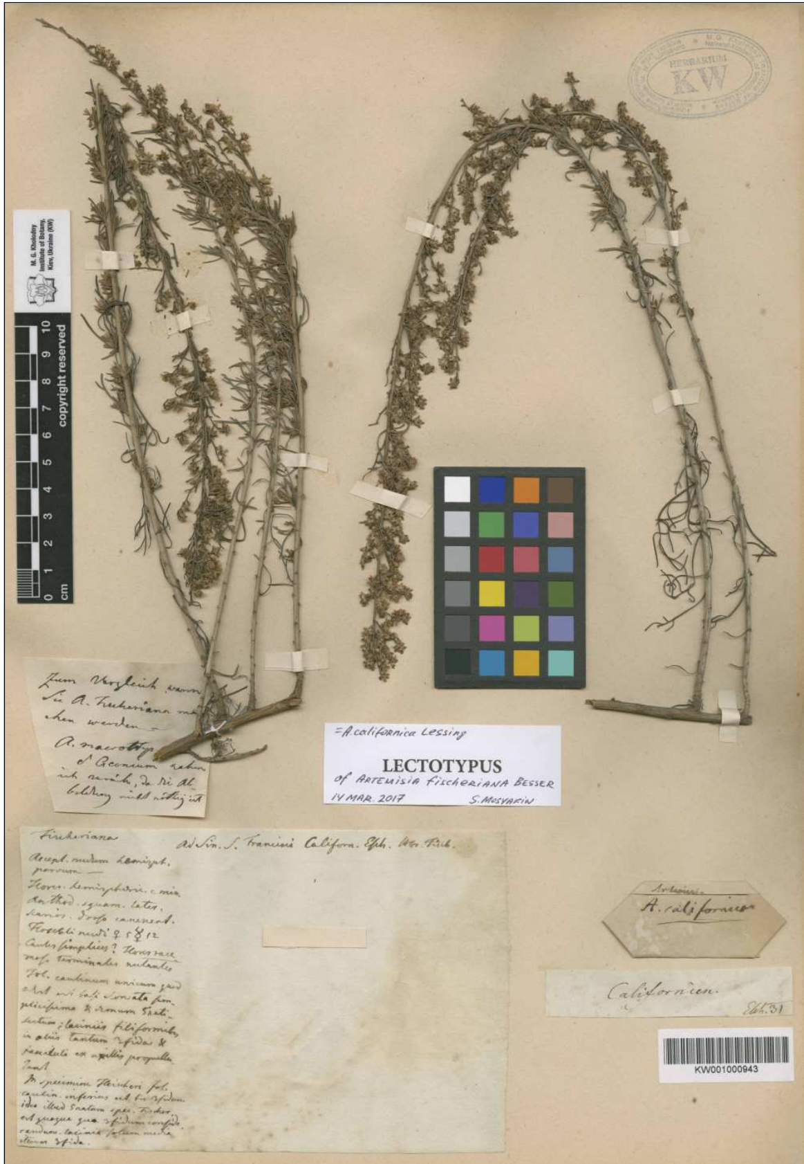
Figure 5. Lectotype of Artemisia fischeriana Besser (KW001000943).