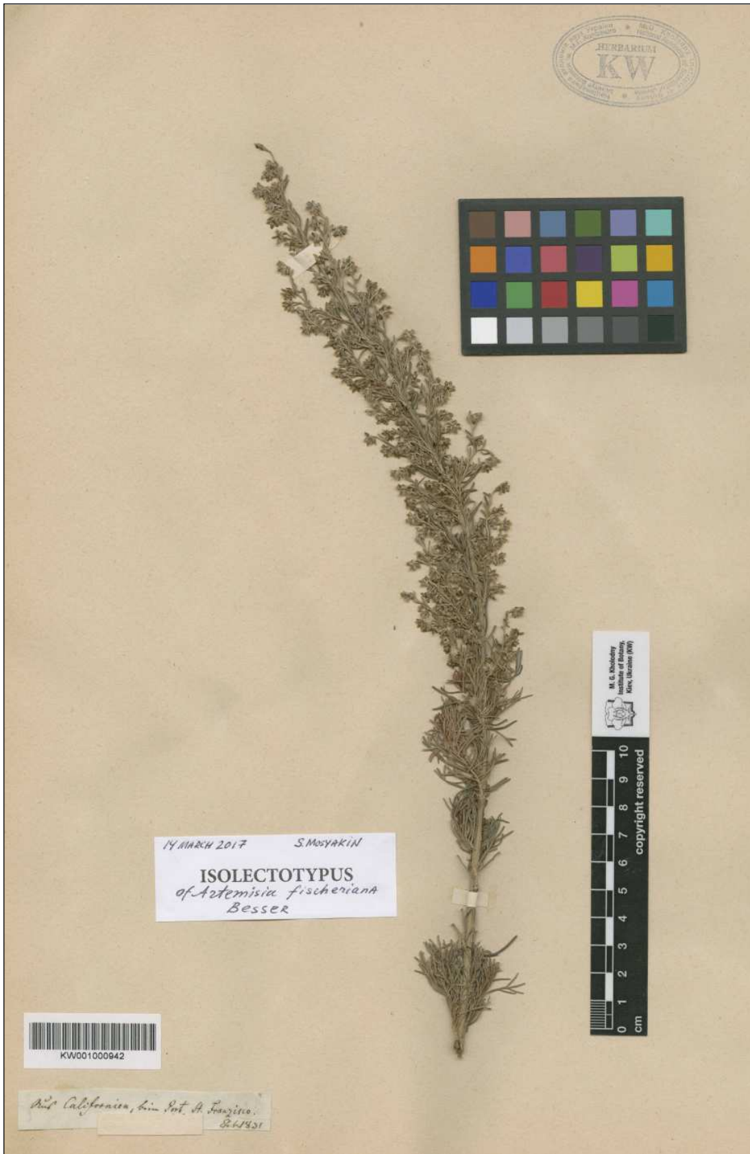
Figure 6. Isolectotype of Artemisia fischeriana Besser (KW001000942).