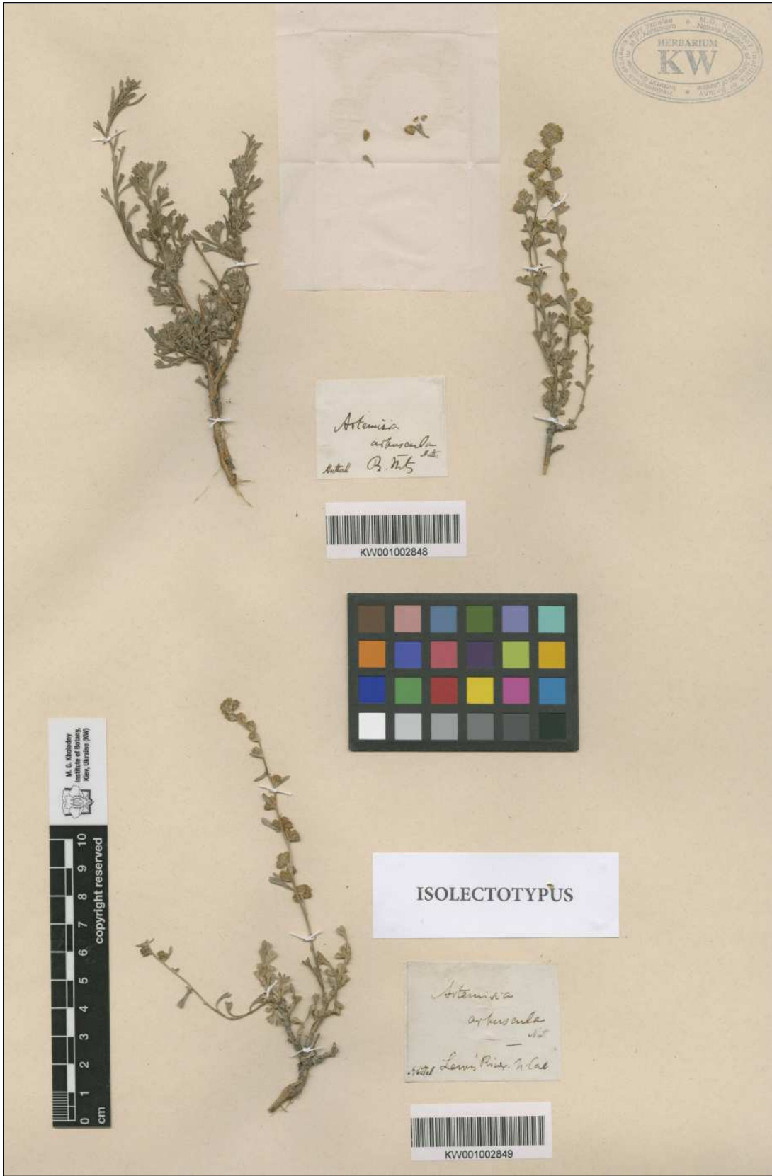
Figure 2. Isolectotypus (KW001002849, bottom) and possible isolectotypus (KW001002848, top) of Artemisia arbuscula Nutt.