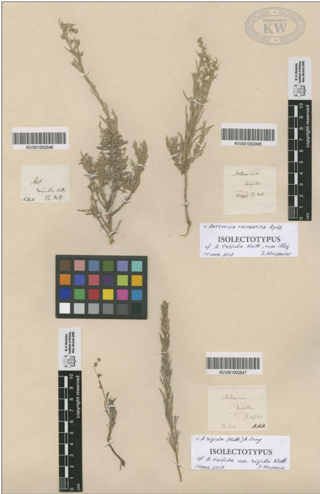
Figure 1. Isolectotypes of Artemisia trifida Nutt. (KW001002845, upper right; KW001002846, upper left) and possible isolectotype of A. trifida var. rigida Nutt. (KW001002847, bottom).