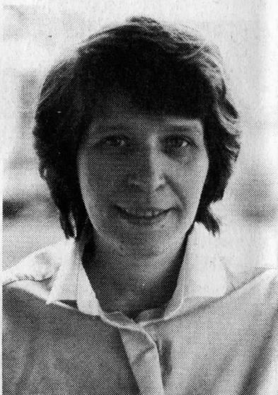
Diana Bingham Council