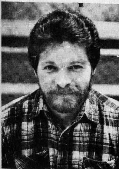
Steve Gudroe Council