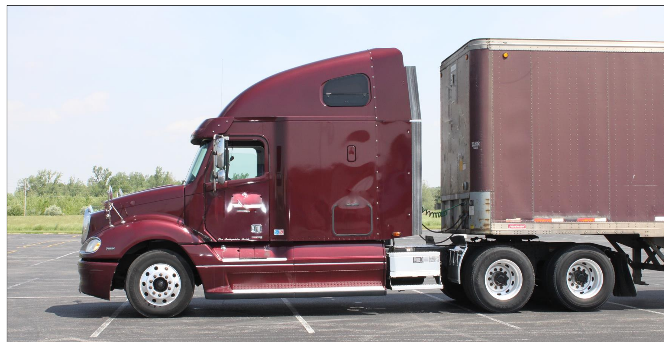
Truck driven by R. & K. Bourne