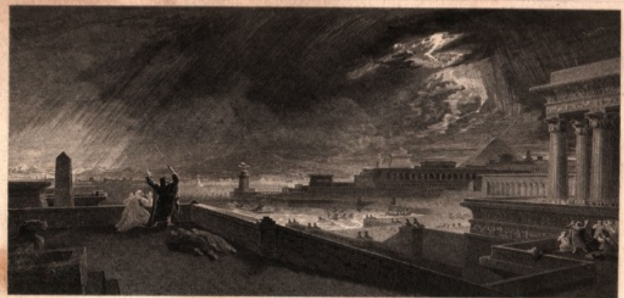
THE SEVENTH PLAGUE OF EGYPT.

Often engravings were commissioned, such as "Mother and Child" from the 1825 Literary Souvenir . (Image 7: "Mother and Child." from the Literary Souvenir , 1825)