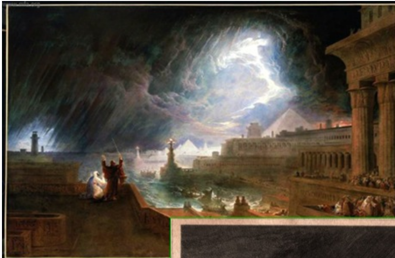
John Martin's "Seventh Plague of Egypt" (Oil on Canvas, 1823)