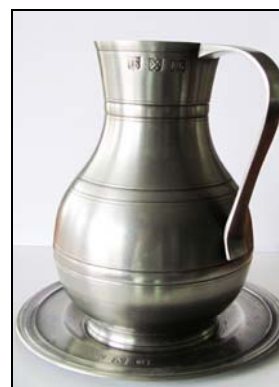
CETEM present in 1992