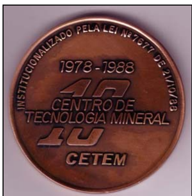
CETEM medal given to the writer