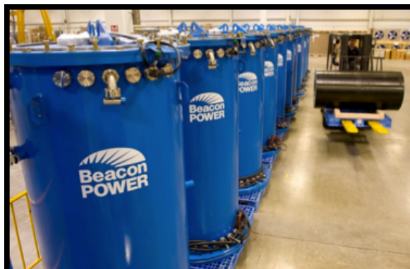
Figure 3: The Smart Energy flywheel constructed by Beacon Power.

Much like wind turbines, the concept of a flywheel has been around for centuries. However, in the last decade there have been rapid advancements in the technology associated with the flywheel energy storage. The current flywheel technology has a rotor made out of carbon filaments and can turn at speeds up to 50,000 rotations per minute (rpm) (Figure 3). The average flywheel used for grid energy storage only spins at a top speed of around 16,000 rpm. To reduce friction, the rotor is contained within a vacuum container and suspended between two electromagnetic bearings [26]. Flywheels work by accelerating the rotor inside the vacuum to an extremely high speed (approximately 1,500 miles per hour) and maintaining the energy invested into the system as rotational energy. Slowing down the flywheel releases the energy stored in the device and powers a generator [27].