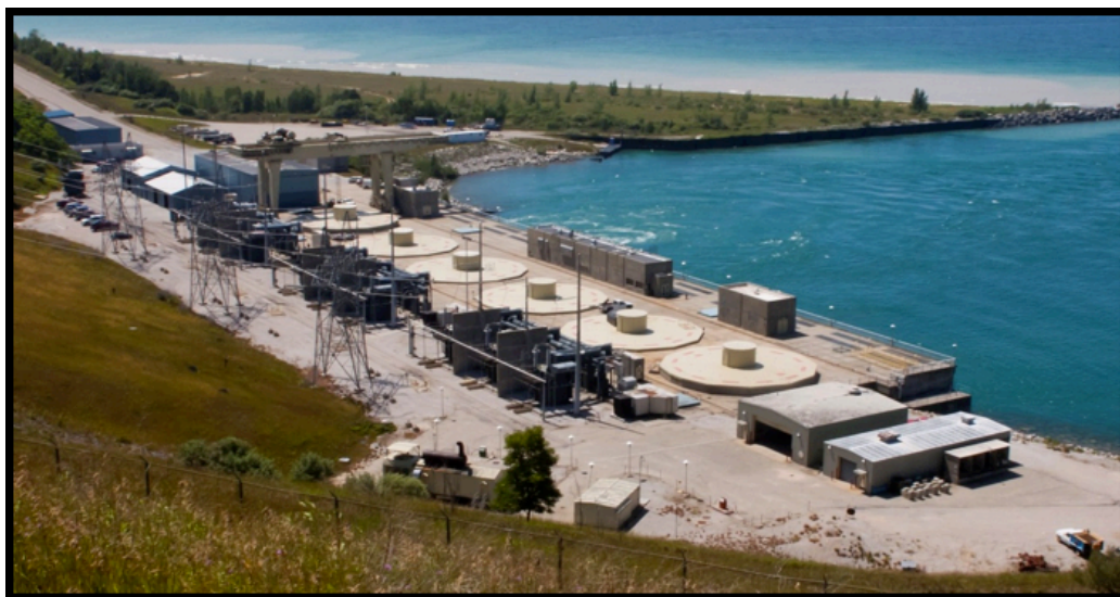
Figure 2: Ludington Pumped Storage Plant's six turbines.

West Michigan already has three advanced battery manufacturers.