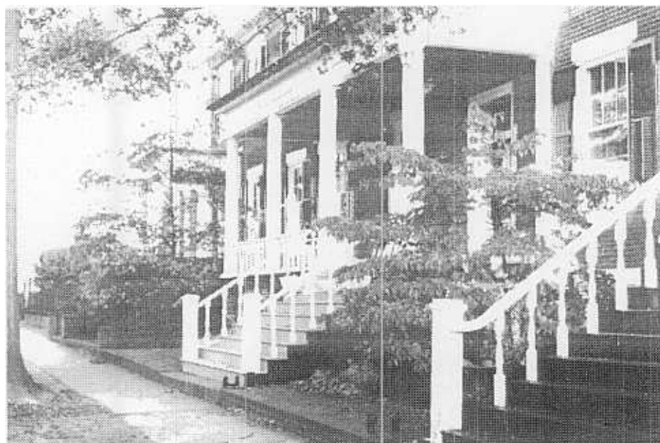
Figure 2. The rehabilitation of historic residential districts can increase property values through local reinvestment efforts.