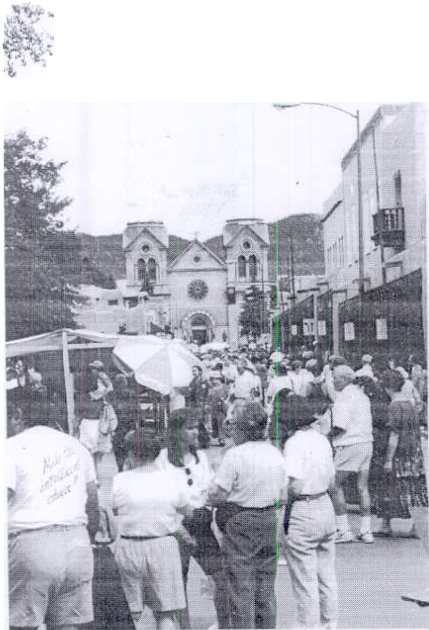
Figure 3. The rehabilitation of historic commercial districts such as this one in Denver, Colorado, provide a unique mix of commercial space and shopping opportunities for the city.