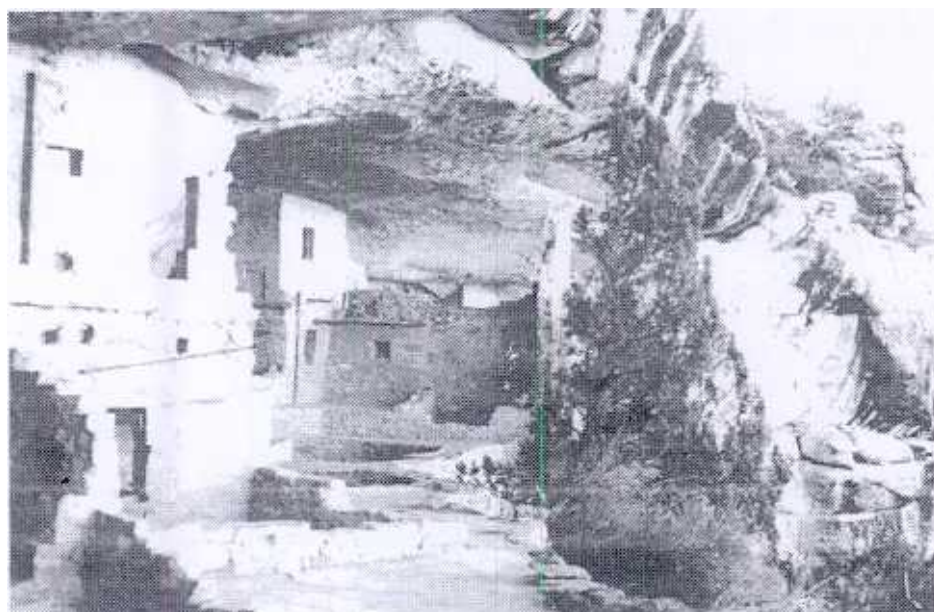
Figure 1. The Conservation of historic sites such as Mesa Verde in Southern Colorado, provides significant tourism income to the local economy.