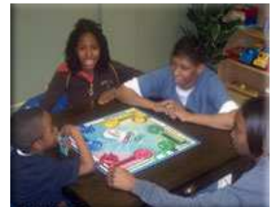
DWJS Bright Space Contact Visiting Room The first mother and child contact visiting space in the country that is located in a jail setting.

Therefore this project addresses a critical area where the criminal justice and community mental health fields intersect, and will further promote collaboration and access to the multiple services female detainees released from the jail need to succeed.