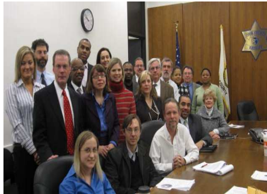
Cook County Sheriff's Reentry Council Members

On December 17, 2009, staff from the State's Attorney's Divi-