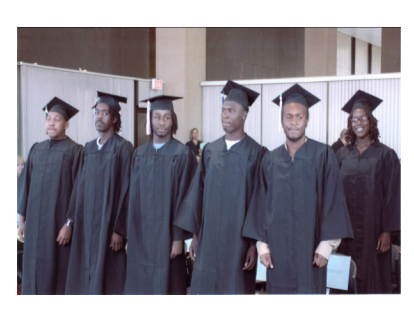
The first six graduates of the Sheriff's Virtual High School program

The Sheriff's Virtual High School is open to 17-21 year olds that are detained on non -violent charges. The coursework is done via computer in four classrooms located in the Cook County Sheriff's Day Reporting Center