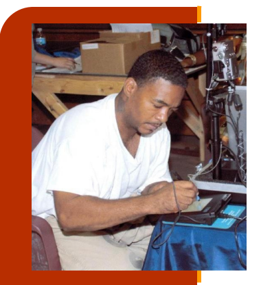
An inmate signs to receive his state ID card