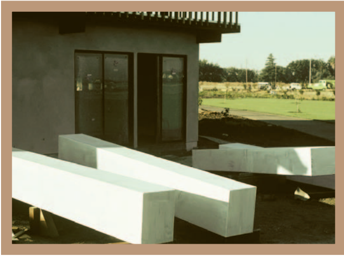
DAVID A. BAINBRIDGE

Three model configurations have emerged: Low water wall tanks (shown primed and ready to install); large wall-height tanks, like this one shown with a complementary wood stove at the Village Homes development in Davis, Calif.; and a counter-height water wall at the office of San Luis Sustainability Group (author Ken Haggard is shown).