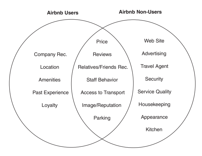
Fig. 1. A pictorial representation of factors for selection of a lodging facility.

users and also confirms the plausibility of the idea of an Airbnb-run loyalty program.