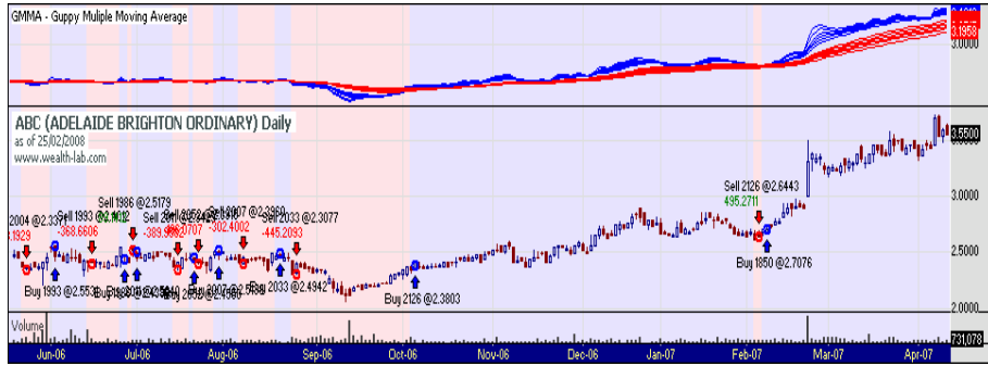
Figure #2. GMMA Signals

The neural networks built in this study were designed to produce an output signal, whose strength was proportional to expected returns in the 5 day timeframe. In essence, the stronger the signal from the neural network, the greater the expectation of return. Signal strength was normalized between 0 and 100.