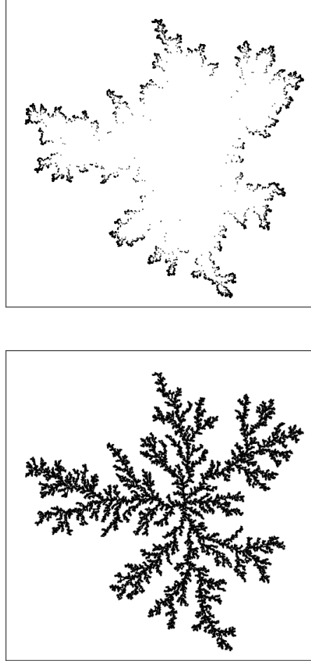
FIG. 1. panel a: the boundary of the cluster probed by a random search with respect to the harmonic measure. Panel b: the boundary of the cluster probed by the present method.

walks, the rarest events are not probed, and no serious conclusion regarding the phase transition is possible.