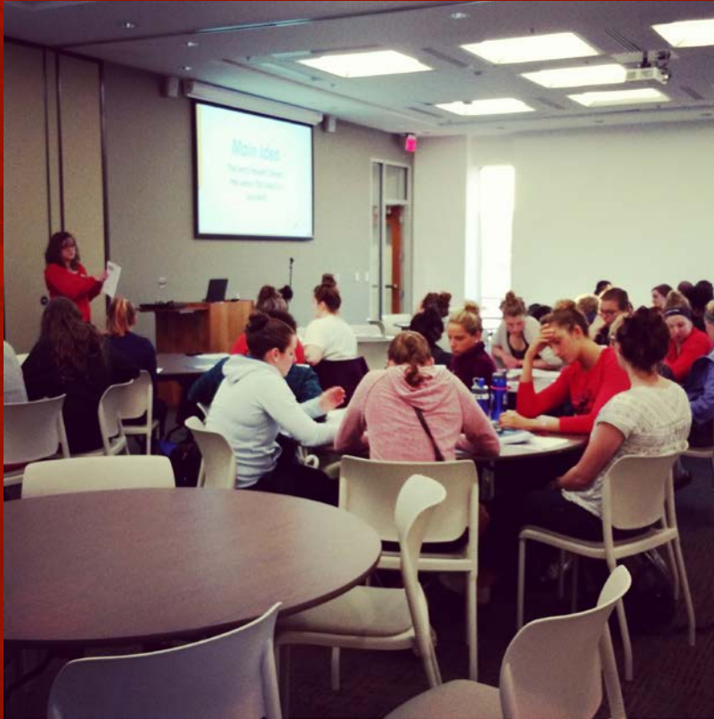
NCAA Student Sessions in the JFL