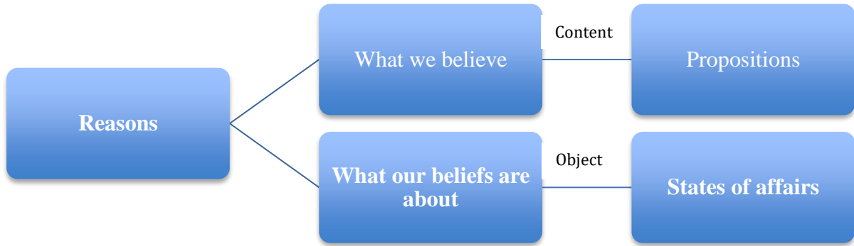
Figure 1. First possible view

The supporter of PRSA, in other words, can, and should, say that reasons are states of affairs in the world and, as such, they constitute the object of our beliefs; yet, this by no means entails that our beliefs need to have non-obtaining states of affairs as their content (or no content at all) – for, the contents of beliefs are correctly identified as propositions.