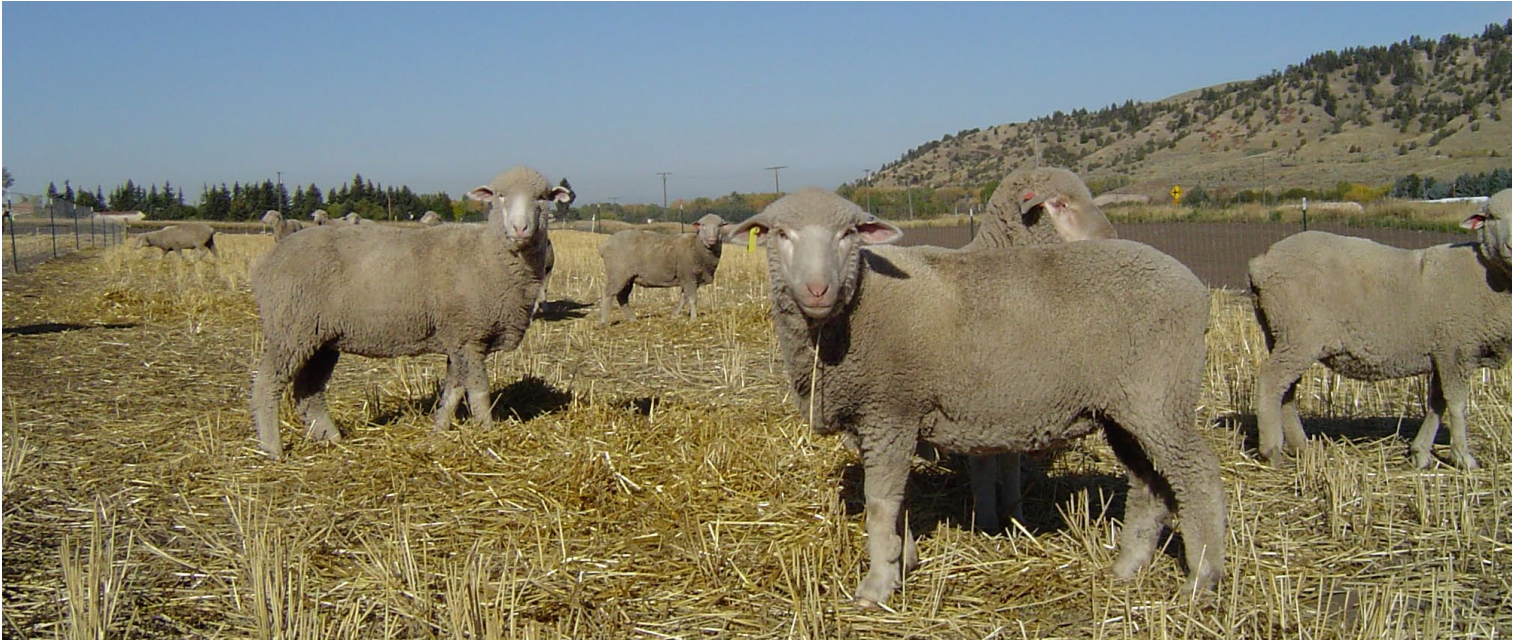
Figure 4. Sheep grazing wheat stubble in Montana, reducing excess crop residue and incorporating organic matter into the soil.

Control of this pest has proven quite difficult. Insecticides have minimal impact because the insect population emerges over a 4- to 6-week period and is difficult to target with a single application. Tillage and burning also have not been very effective. Plant breeders are working on this problem, but the solid-stem varieties of spring and winter wheat developed so far have only variable resistance to the insect. In addition, the yield with the resistant varieties can be lower than susceptible varieties when sawflies are not present. Breeders are developing newer varieties with improved yield, sawfly resistance, and forage value, but so far results are inconsistent.