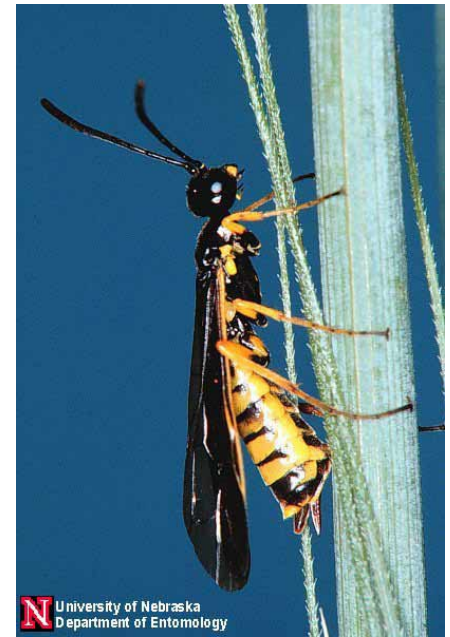
Figure 3. Adult female Wheat Stem sawfly.

Sheep grazing of crop residues offers growers a viable alternative. It is responsive to environmental goals and restrictions and can be adapted to a variety of residue handling practices. For example, sheep can graze either spread or windrowed straw: Windrowing the straw may increase the amount available for consumption by sheep, because less is lost to trampling, whereas spreading provides a more uniform residue cover, which can help prevent erosion along with the grain stubble still rooted in place.