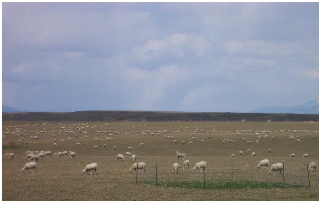
Figure 5. The aftermath of sheep grazing alfalfa in Montana. Grazing reduced harmful insect infestations without impacting hay production.

Sheep Grazing for Residue Management and Control of Wheat Stem Sawfly. Studies were conducted at eight sites on four Montana farms with high wheat stem sawfly infesta-