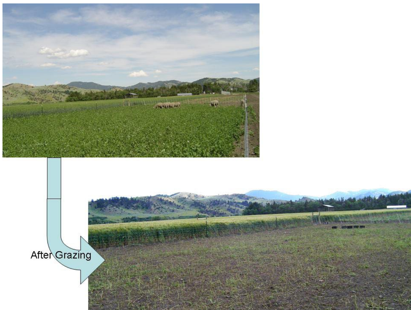
Figure 1. Sheep grazing successfully controlled weeds in a summer fallow field at Montana State University.

Targeted grazing of sheep can be a viable alternative for managing weeds on fallow land since many weeds found in summer fallow rotations (e.g., volunteer grain, kochia, Russian thistle, wild oats, and cheatgrass) are highly palatable to ruminants, particularly when in the young vegetative phase. However, not all weeds are palatable and so it is important to know which weeds are predominant in fields to be grazed. In one study from the 1970s, researchers found that six of 12 species of annual weeds in the young, vegetative growth phase were as palatable as oats to grazing sheep: yellow foxtail, barnyardgrass, green foxtail, redroot pigweed, Pennsylvania smartweed, and common lambsquarters. 2 Four other weed species were unpalatable to sheep and two were identified as “interactors,” i.e., some sheep found them palatable, whereas other sheep refused to graze them. Other research at Montana State University has shown that volunteer wheat is also highly palatable for any class of ruminant. Some weeds growing in summer fallow,