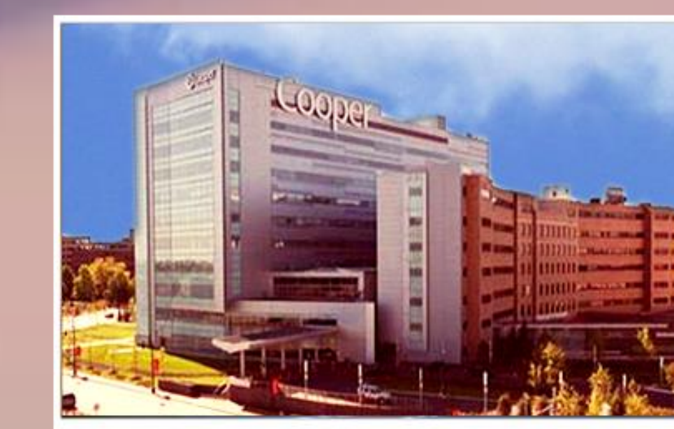
Cooper University Hospital