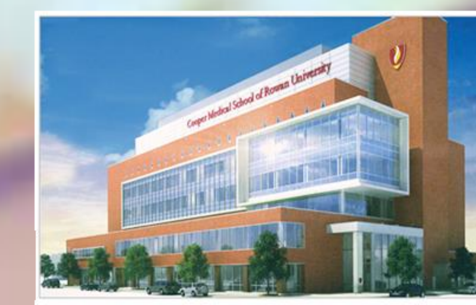
Cooper Medical School of Rowan University