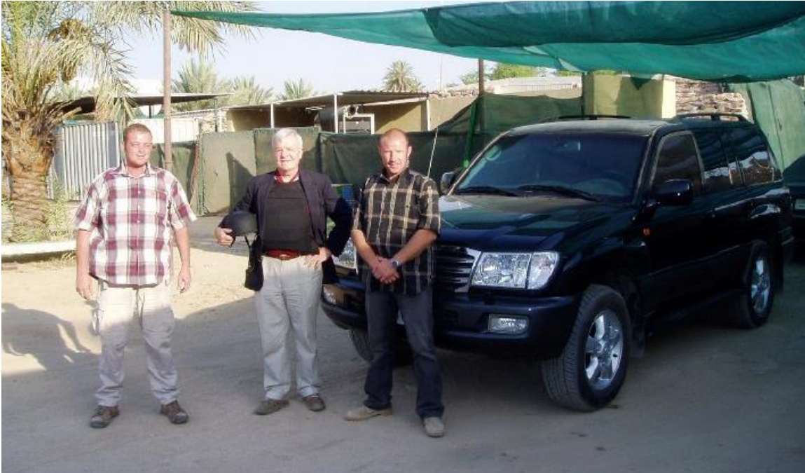
Two PSDs (Personal Security Details) and me with our armored car in the BearingPoint Camp in the Green Zone, August 2004.

Central Bank, or the Green Zone unless I traveled with two armored cars with armed PSDs (Personal Security Details). The PSDs were generally South African, Australian, or English ex-military. However, our drivers were sometimes Iraqis. There were even several women drivers and shooters (as the PSD in the front passenger seat was called).