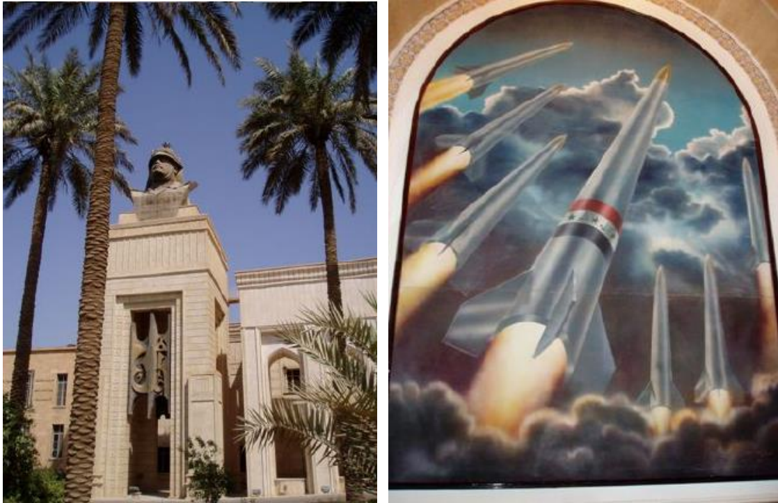
Front view of the Republican Palace and Inside the Chapel of the Palace, May 2004.

outside was long enough to require advance planning. Fortunately, by this visit the water problem had been fixed.