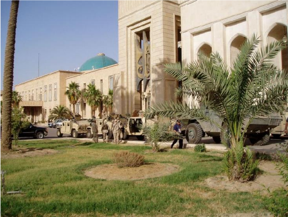
Front of the Republican Palace, September 2004.

For most of us, the Palace mess was the only place we could eat. It attracted those of us with offices in the Palace, large numbers of soldiers taking refuge from the fierce heat outside, and those who lived in the trailers that had been set up just behind the Palace (or in some cases in rooms of the Palace itself). Each diner dressed accordingly. Thus the halls and the lounge areas (where Saddam never meant them to be) were full of soldiers, contractors, and CPA staff in every imaginable dress. Some were in the dress military uniforms I see at home in the Crystal City underground (next to the Pentagon) as officers walk briskly from meeting to meeting. Some were in camouflage fatigues with long guns hanging from their shoulders or M16s in their hands. Some were heavily packed with combat gear just back from the “field.” Special Forces guys liked to strap their pistols to their thighs. Bank examiners preferred the more traditional belt holster; three bank examiners in my office carried pistols. Almost everyone was armed. Shuffling in between these were men and women in flip flops and shorts on their way to or from the shower or heading for a lounge chair to relax or maybe coming from or going to the swimming pool behind the Palace. I have never seen such a strange mix of people in such