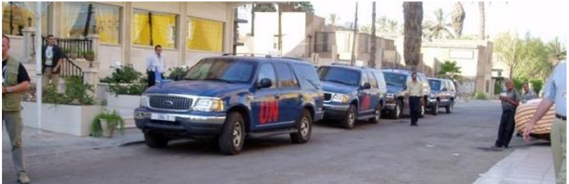
Across the street from our residence in Baghdad in July 2003. UN cars picking up Sergio de Mello, UN Head of staff in Iraq before he was killed in the Canal Hotel bombing.

From these early mistakes, the situation has deteriorated further, notwithstanding the new schoolrooms built, the increase in potable water, the restoration of oil output, a very modest increase in electrical output, and other accomplishments. They fall far short of Iraqi expectation and what was possible. This book documents what I saw and heard when I returned in May 2004 for two months and again in four two weeks through the end of 2005.