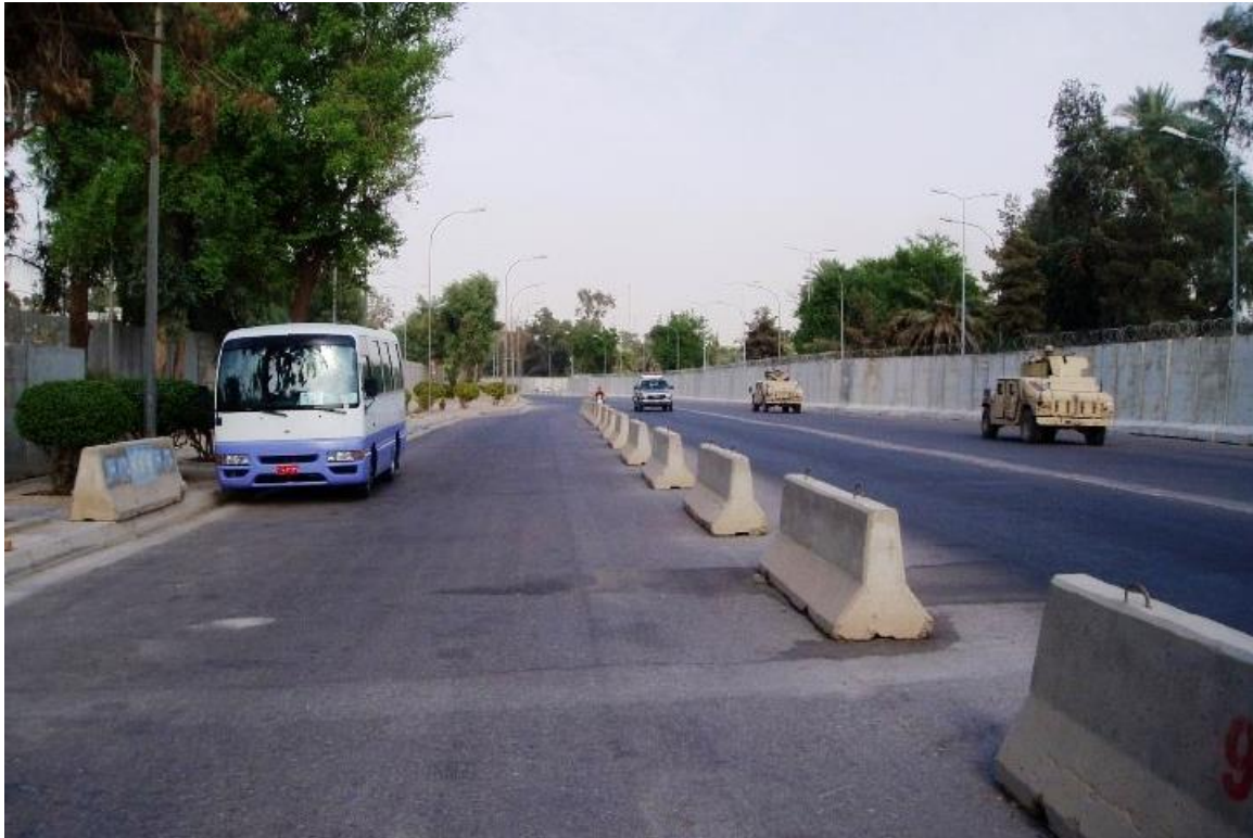
Road between Camp and Palace. Behind the new wall between Camp and Palace is the Intelligence compound.

number to wash. Most often I failed and returned home each day to a freshly washed pair of underpants.