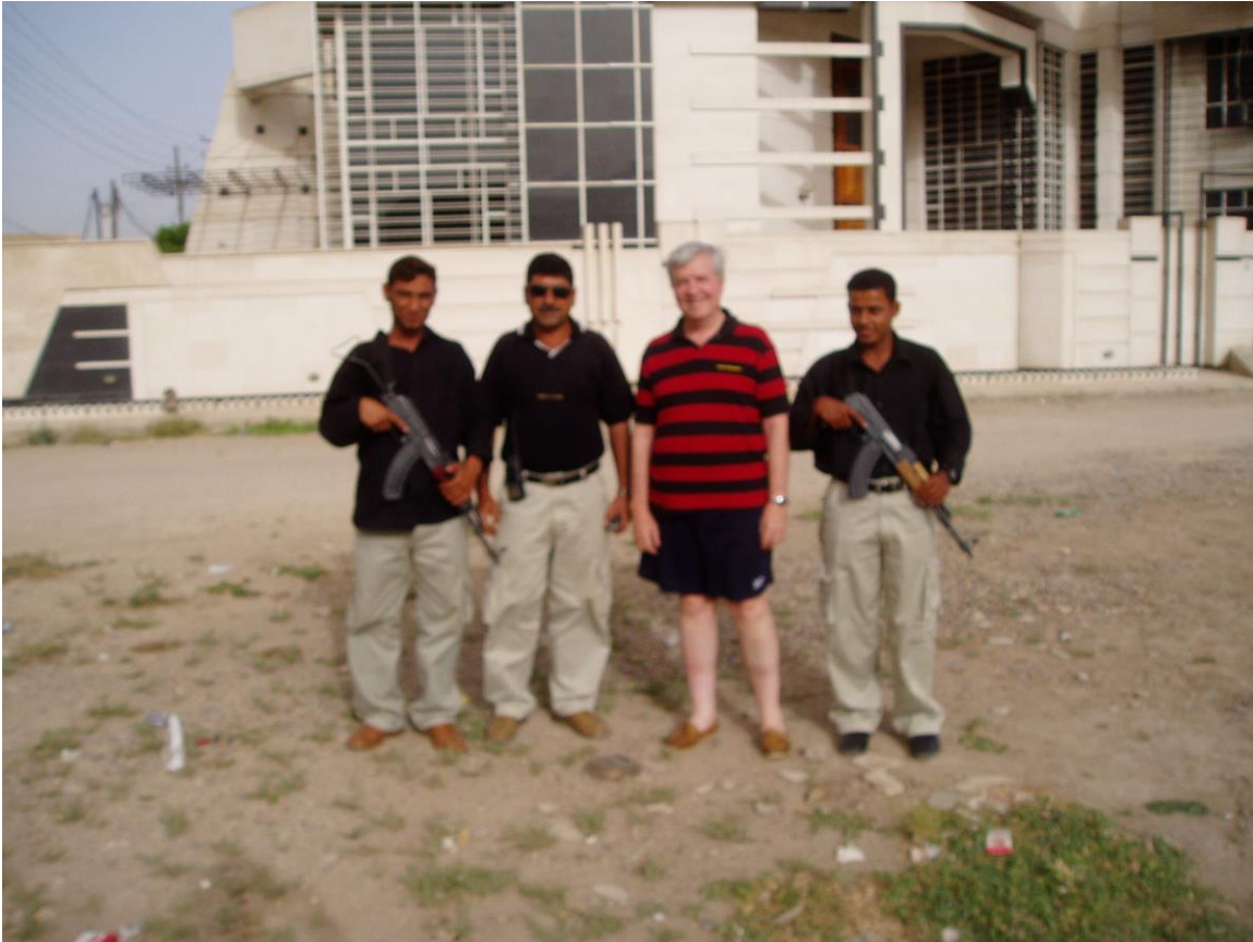
The White House (my home) in Baghdad, May 2004.