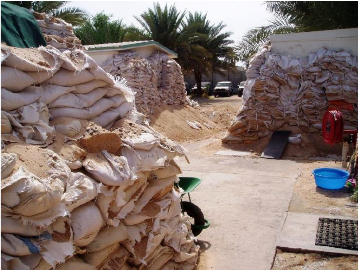
Burst sandbags at BearingPoint Camp, August 2004.

This time around I stayed in one of the trailer rooms in the BearingPoint Camp. These rooms were the size of a typical hotel room and each had its own bathroom. Each room had satellite TV and wireless Internet access. There were five rooms on each side of the hallway down the middle of the two very large trailers joined together. In addition to four such configurations the Camp also had two large offices formed by joining two large trailers together and a recreational trailer with a pool table, large TV, kitchen and two meeting rooms.