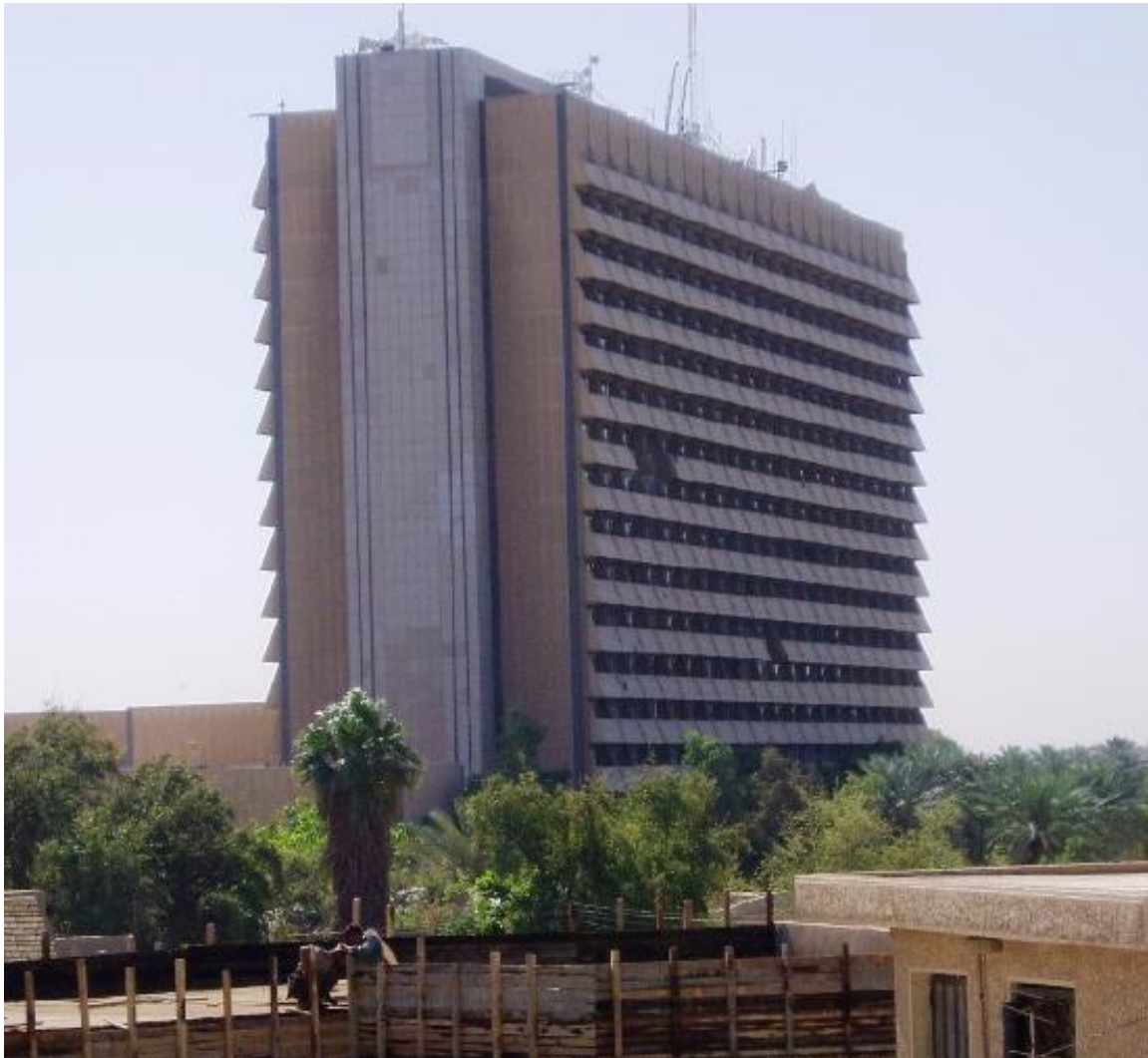
The El-Rasheed Hotel inside the Green Zone from the roof of the White House (outside the Green Zone), June 2004.

or guards (although this began to change later in the year). There were even cars available that you could drive over to the convention center or to one of the several restaurants in the Zone. There were also shuttle buses to the same places. Unfortunately many people living and working in the Green Zone found it convenient and relatively safe to stay in the Green Zone most of the time. As a result, their contacts with Iraqis were limited. Rather than spending most of their time with the Iraqi's they administered or advised, they spent it in the Palace with other CPA staff. It was not a healthy environment in which to rebuild the country or develop democracy.