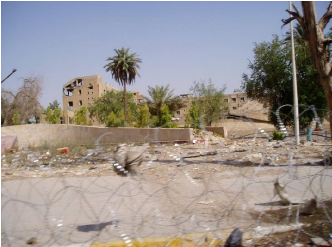
Streets of Baghdad, June 2004.

be standing unhurt, but a rather large number of larger buildings were either seriously damaged or completely gutted. Perhaps such damage was found in 10 to 15 percent of the larger (non-residential) buildings, but this is my pure guess. While most of the city seemed to consist of two to three or four story buildings mixing residential and office or shop space, the taller office buildings tended to range from ten to twelve or so stories tall. There was very little sign of construction, except of high concrete security walls going up everywhere in the Green Zone. This sad state of affairs was made worse by razor wire and concrete barriers set up most of the places I seemed to go. It was a pretty ugly mix.