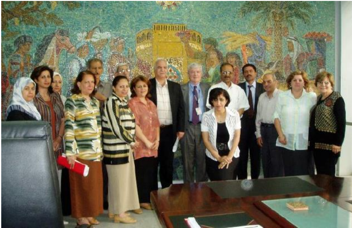
Farewell picture with my counterparts in the Central Bank of Iraq, June 2004.

with me privately afterward and asked me to please return as often as I could (two or three weeks every other month is what I said I was willing to do--starting in September and assuming the security situation is better). Aside from my strong disappointment that the Governor had not chaired the Briefing meeting, it was a very nice way to end my hard work there.