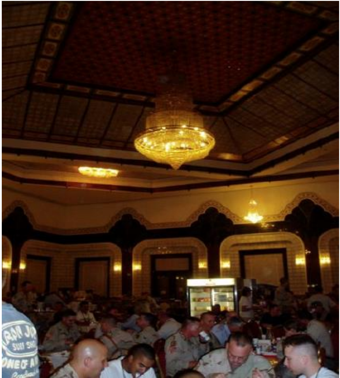
Republican Palace Mess Hall, May 2004.

it easier to pick one up. We would pick up our plate and hand it to a server in one of the many processes that made no sense to me. The food of the day could be seen through a glass shield, but was also identified by name—fried chicken—to remove any remaining doubt. After reconnecting with our plastic plate, now filled to our specification, we proceeded to the drinks—warm cans of familiar soft drinks, coffee and tea, and on rare occasions ice. The ice, on those rare occasions, had to be scooped up with a large spoon and guided into a paper cup on the tray carefully balanced in our other hand.