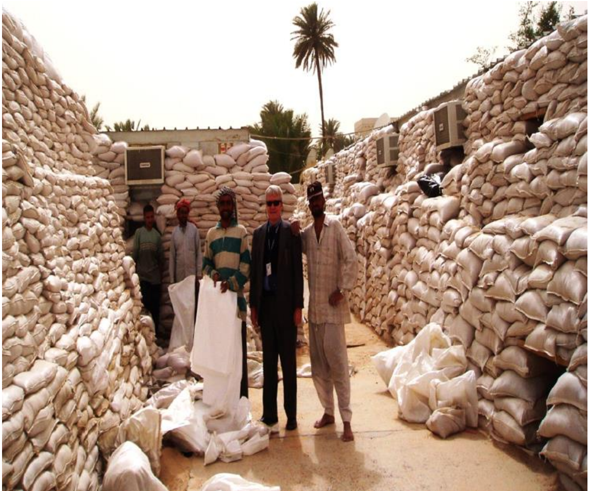
Me with an Iraqi worker in the BearingPoint Camp in the Green Zone, May 2004.