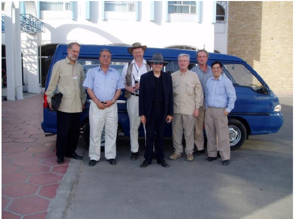
The IMF team at the UN Canal Hotel in July 2003(before it was bombed)

On that first trip we traveled on a UN-World Food Organization charter flight from Amman. We were actually booted from our intended flight and had to return to our hotel and come back the next morning. The WFO guy at the airport had no record of our “confirmed” reservations in his printout. Post war environments are rarely well organized. The experience was not terribly different from my UN-WFO charter flights into Kosovo in its early days or the NATO C-130 charters from Zagreb to Sarajevo in the early days of my work in Bosnia and Herzegovina (except that the C-130s were clearly military transports with military seating and “service”).