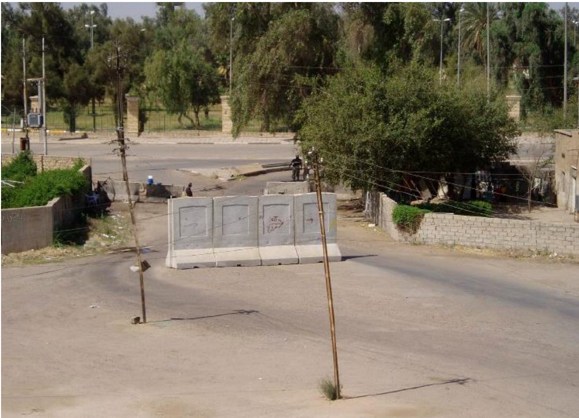
Entrance to the White House (my BearingPoint residence) neighborhood just outside the Green Zone, Baghdad, May 2004

Following dinner with Betsy, I walked back to the BearingPoint camp to gather my luggage and finally see where I would live. I was driven directly from the Camp to Alpha 3 (radio code for my residence to avoid giving too much information to the enemy), known to BearingPoint advisors as “The White House.” Our White House had none of the charm of the other one. It was a relatively large and spacious modern home (thus ugly) in an affluent, walled and guarded neighborhood just outside the Green Zone. It was very close to the El Rasheed Hotel, which was just inside the Green Zone.