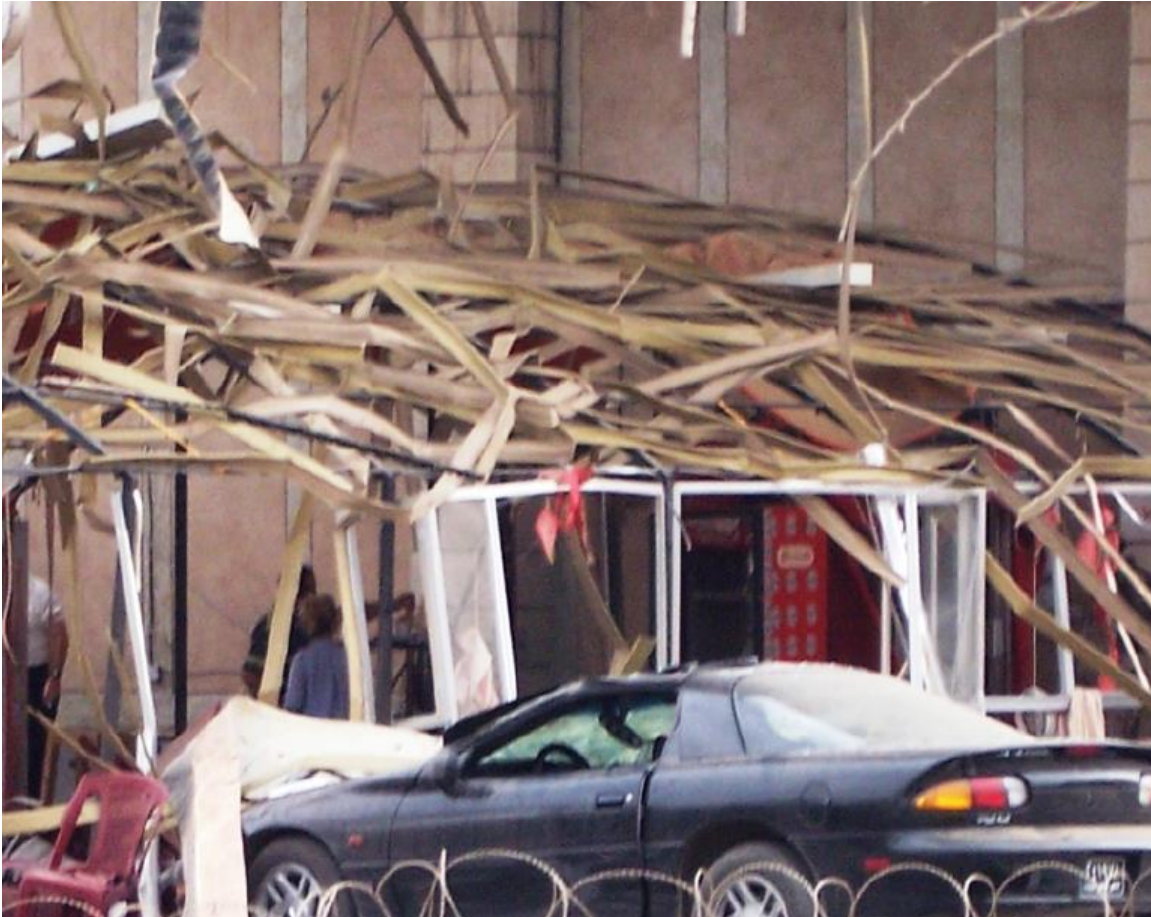
The Green Zone Café after the suicide bombing in October 2004.

Ramadan (after midnight), an explosion was heard in the Green Zone Café from the nearby market. Within seconds the Iraqi who had remained in the Café blew himself up taking several of the other Café patrons with him (to where ever he was going—though they may have gone to different places).