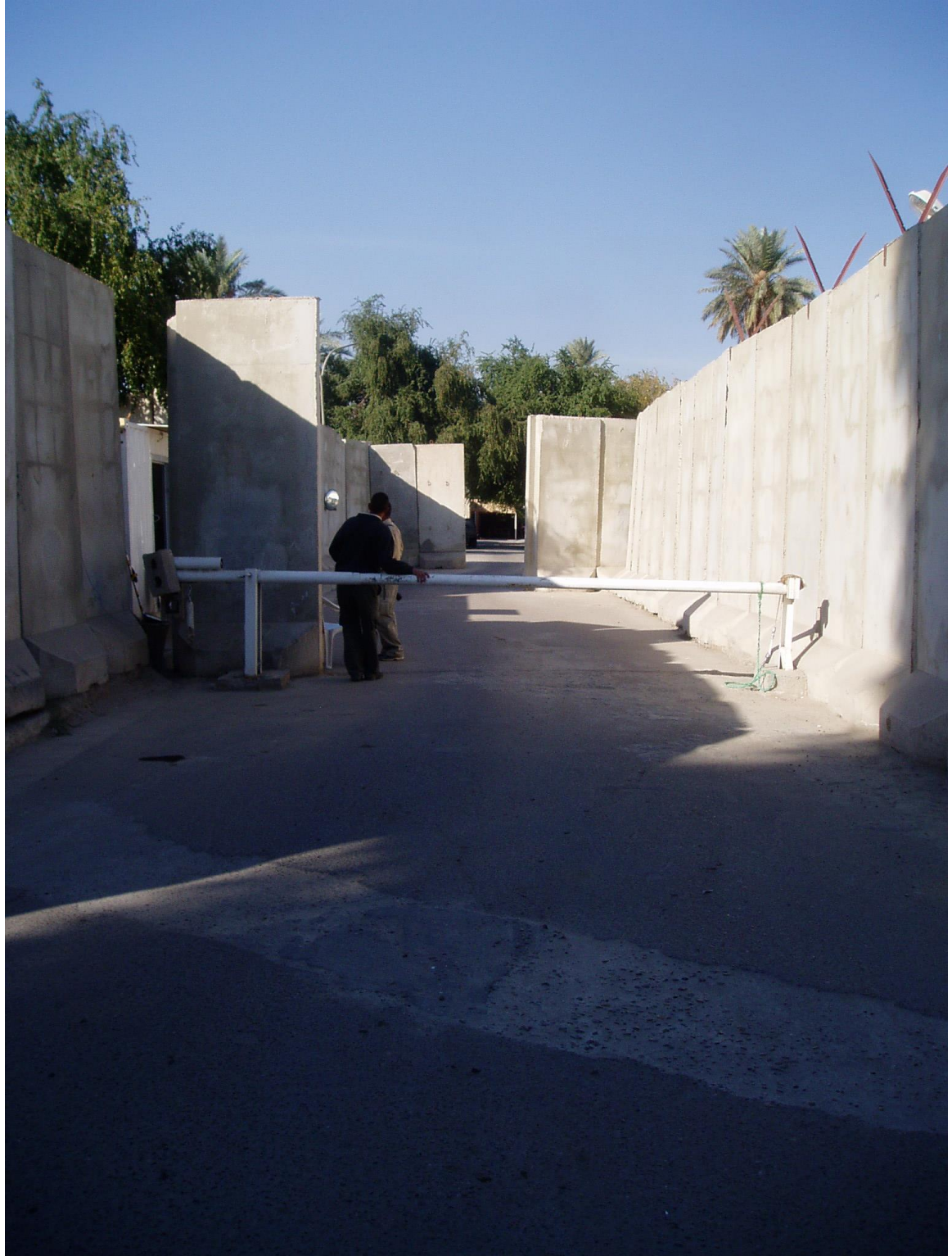
Entrance to BearingPoint Camp

Deteriorating security was evidenced in other ways as well. Most of my meetings