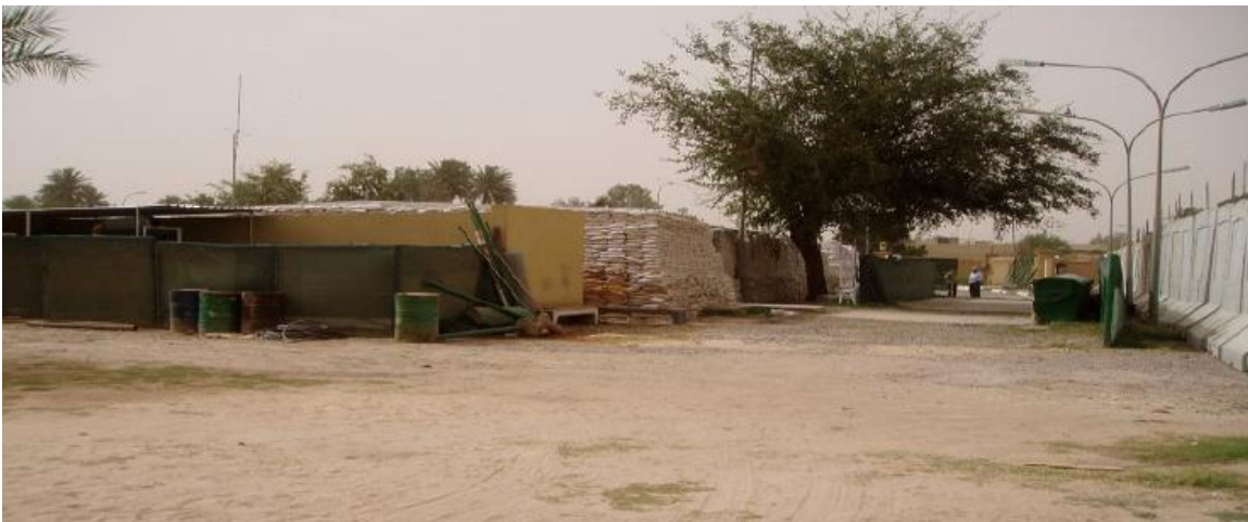
BearingPoint Camp in the International (Green) Zone, June 2004