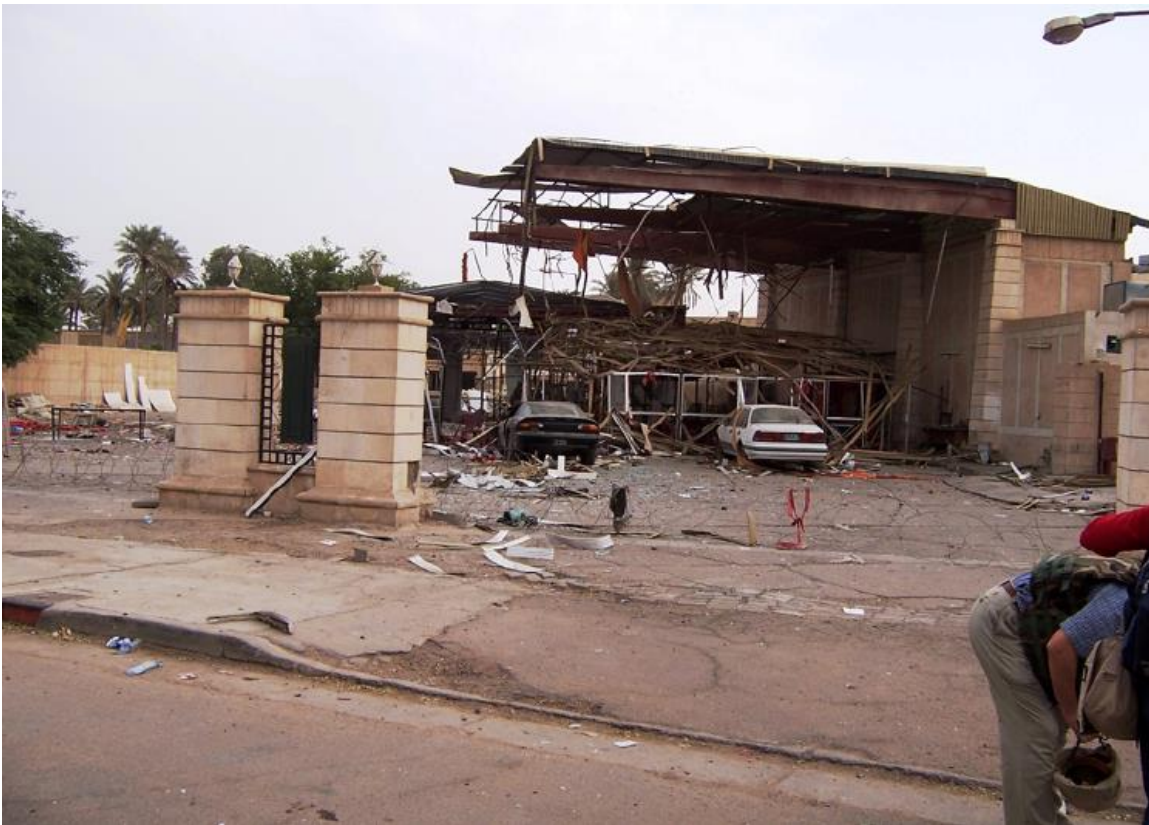
The Green Zone Café after the suicide bombing in October 2004.