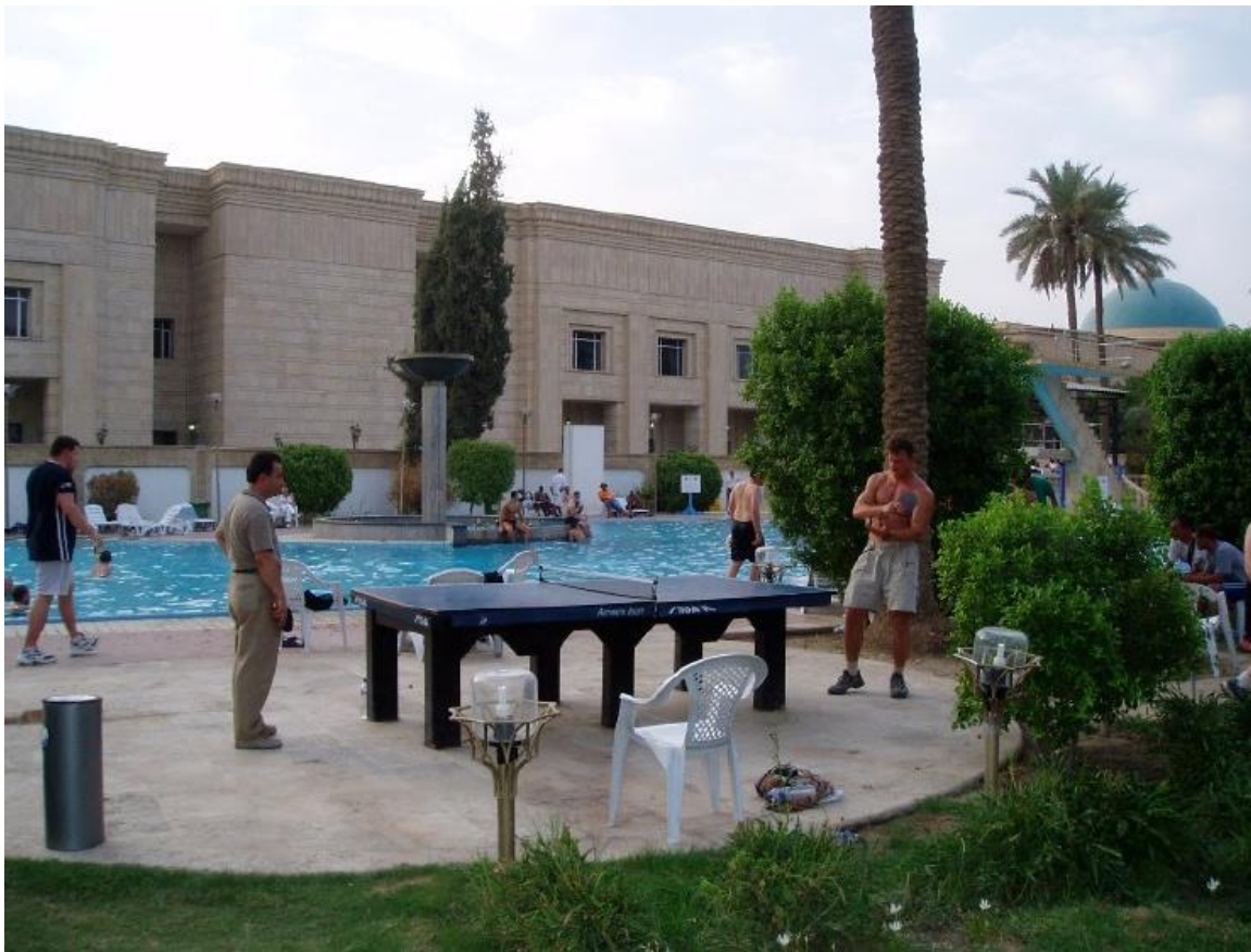
Pool behind the Republic Palace, June 2004.

The area behind the Palace now houses hundreds of CPA officials in trailers well hidden by thousands of white sand bags. The sand bag cities contrast sharply with the luxurious swimming pool, party area, and park immediately behind the central part of the Palace. Here I could see General's Sanchez, Kermit and others relaxing at the end of the day. It was also the scene of a growing number of farewell parties as the hand off of sovereignty approached and CPA staff went home. Young Marines could generally be found there showing off from the high diving board. Unfortunately I never went swimming there and visited the pool only for the farewell parties. While watching American Marines splashing in the pool, I could not help but speculate about the parties Saddam must have there.