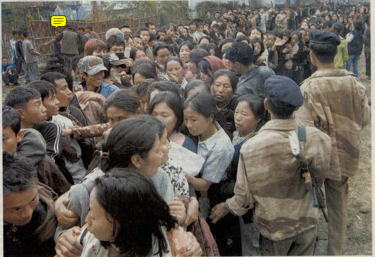
WINNING THE COUNT: The fear of losing Assembly seats to other communities during delimitation of constituencies triggered a contest that blurred the distinction between census and election. A 2008 picture of voters outside a booth in Dimapur 1 constituency in Nagaland.

Nagaland's small population (19.81 lakh) is divided into over two dozen tribal and non-tribal communities. Inter-community competition for scarce public resources manifests itself in a variety of ways in Nagaland: resentment against outsiders (Bangladeshis), movements for reservation in educational institutions and government jobs, demands for division of Nagaland along tribal lines,