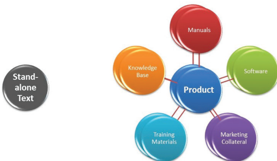
Figure 3: Product-centric translation, where a text to be translated is not only connected to a product, but to earlier versions of the same text, earlier versions of the product, and other texts that are connected to the same product, as well as earlier versions of those other texts. These relationships that are typical for technical translation projects raise a variety of consistency issues, which are absent from the translations of stand-alone/literary texts.

The competencies and processes outlined in standards like ISO 17100 can be used as a roadmap for (re-) orienting their curriculum and faculty—not to mention internship—development efforts.