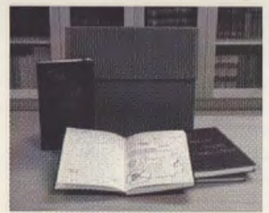
The Allen Reading Room Challenge books.

gathered by the library provide some information about how students use and view the library, but they do not go very far in revealing how students perceive the