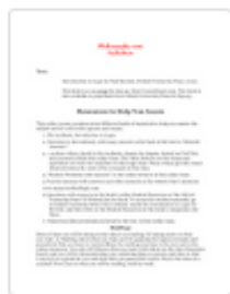
Phil & 120 Generic Syl...