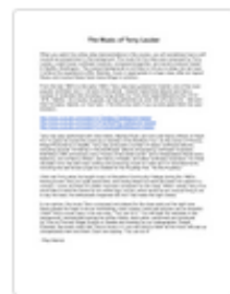
PHIL&120 About the ...