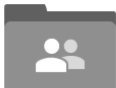
PHIL&120 Quizzes an...