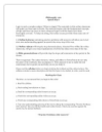
Phil 120 Quick Start