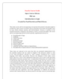
Phil & 120 Faculty Co...