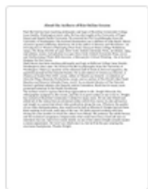
PHIL&120 About the ...