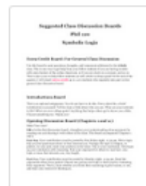
Phil & 120 Suggestion...