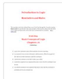
Phil & 120 Reminders ...