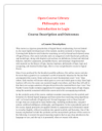
Phil & 120 Class Des...