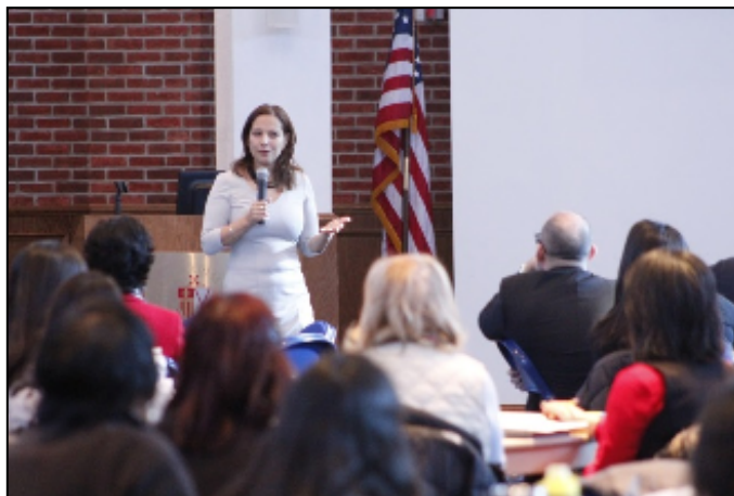
Angélica Infante-Green Associate Commissioner, Office for Bilingual Education and World Languages New York State Education Department