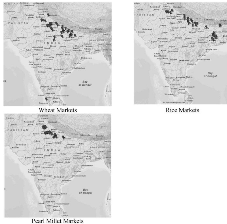
Figure 1. Mandi Locations by Commodity

Each regulated market, or mandi , must report the minimum, maximum, and modal prices to the Ministry of Agriculture on each day and for each crop that a transaction occurred. The Ministry of Agriculture makes these data available to the public, and we obtained data on wheat, rice, and pearl millet prices from the Indian Ministry of Agriculture's website. Our data set contains daily prices from 2005 through 2011. From the number of missing observations, we observe that many mandis in our data set are not major markets in the commodity of interest and contribute to the large number of missing daily price data we observe in our data. We keep those markets where more than 50% of the observations are not missing.