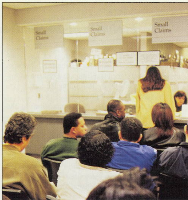
Parties who have agreed to have their cases heard by an arbitrator wait their turn at the small claims office in Queens, while a woman inquires at the window about filing a new claim.

Although this process allows a claim to be instituted on multiple hearsay, ultimately claimants and counterclaimants may not obtain judgment, either at inquest 8 or trial, unless they make out under oath 9 a prima facie case of liability by establishing all the elements of a cause of action by credible, "competent evidence, and not mere inference or surmise." 10 (See below for a discussion of the evidentiary considerations when the case is heard.)