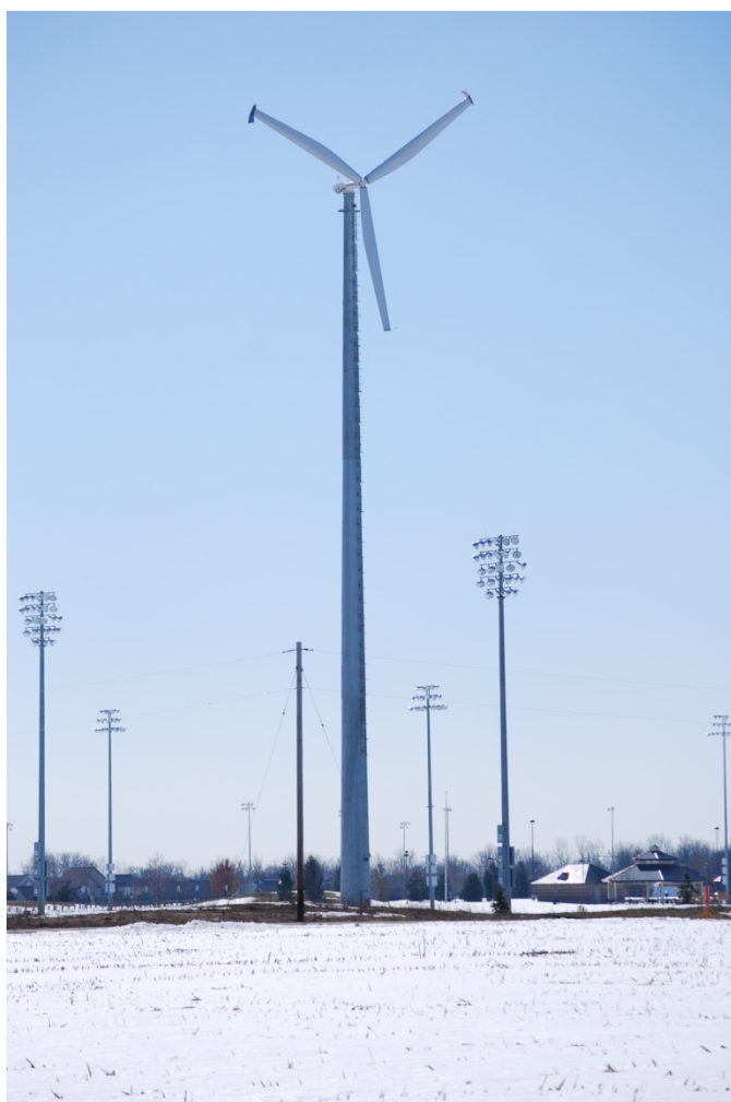
Figure 2. One of two 50 kW turbines in near Zeeland, Michigan. Each tower is 125 feet tall.

As recent experiences in West Michigan demonstrate, varieties of groups organize and become involved in the process of reviewing a wind energy project. An analysis of wind energy projects in England, Wales, and Denmark found that projects “with high levels of participatory planning are more likely to be publicly accepted and successful” [7, p. 2658]. High levels of information and public participation were also associated with successful projects in France and Germany [8]. Stable supporting networks are more likely to form when public participation is high. However the presence of these groups is not mandatory for project acceptance and deployment. More important to deployment was the presence of opposition groups. The absence of a stable network of opponents was linked to project acceptance and deployment [7]. The knowledge, attitudes, and values that West Michigan residents hold about energy development, quality of life, and the community engagement process may similarly influence public participation.