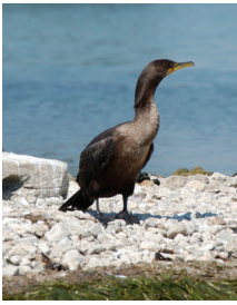
Figure 4: Water-birds, like this cormorant, may fly through or around offshore wind farms in the Great Lakes.