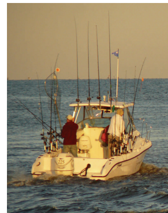
Figure 1. Fishing is an important recreational activity in Michigan's Great Lakes.

Fishing, both commercial and recreational, contributes substantially to the economies of Michigan's coastal communities. In 2006, more than 1.4 million recreational anglers fished Michigan's waters, including the Great Lakes, and contributed over $1 billion to Michigan's economy [4] (Figure 1). Michigan citizens who attended Great Lakes Offshore Wind Council meetings held widely varying opinions regarding the pros and cons of wind energy development on Great Lakes fishing [5]. Many anglers, conservationists and coastal tourism industry representatives have raised concerns about potential negative effects of noise, habitat alteration and electromagnetic fields on fish populations, while others anticipate some benefit to fish populations.