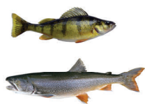
Figure 3: Scour protection would likely attract a variety of game fish, including lake trout and yellow perch (above).

Though there are no wind turbines in the Great Lakes, there are underwater structures and artificial reefs from which we can make some comparisons. A variety of game fish species are known to use artificial structures in the Great Lakes (Figure 3) [15]. The crevices of a turbine foundation's scour protection would also provide ideal habitat for invasive species like zebra and quagga mussels and the round goby [7]. It is unclear whether these structures would actually increase the overall abundance of game fish, rather than just attracting them to a particular location. In many Great Lakes environments, water temperature fluctuates widely, and important game fish are likely to use artificial habitats only when temperature is ideal.