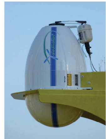
Figure 7. A close-up of the Vindicator unit which is mounted on the buoy (Fig 6) and measures wind speeds at multiple heights using laser pulses.