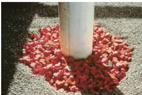
Figure 2: Scour protection, like this example from a bridge support column, is used to minimize erosion around the turbine foundation