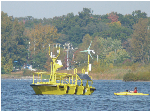
Figure 6. GVSU's wind assessment buoy completed a trial in Muskegon Lake before being deployed in Lake Michigan.

Much site-specific information needs to be collected to determine the precise effects, both positive and negative, of an offshore wind farm in Michigan's Great Lakes. Experience from Europe suggests offshore wind farms, if properly sited, can generate low-pollution electricity without significantly disrupting local ecosystems. Grand Valley State University's research buoy will enhance understanding of the wind resource and the Lake Michigan ecosystem.