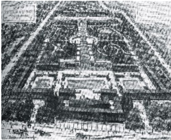
Figure 1: A perspective view of Burnap's original plan for Meridian Hill Park (Burnap, 1916)

Several published books were central to the neoclassical landscape movement and the development of sceniographic and iconographic tendencies: Charles A. Platt's Italian Gardens (1894), Edith Wharton's Italian Villas and their Gardens (1903), Charles Latham's The Gardens of Italy (1905) and a compilation of papers presented at the American Society of Architects conference in 1900 and subsequently published in a book of three essays, European and Japanese Gardens (1902). While Platt, Wharton and Latham brought their appreciation of Italian gardens to a wider American audience, Guy Lowell in American Gardens (1902) focused his arguments on the development of American style and the importance of its derivation from European precedents. Other books, such as Shepherd and Jellicoe's 1925 Italian Gardens of the Renaissance and Nichols 1928 Italian Pleasure Gardens , were later editions that answered the demand for additional literature on Italian gardens and helped to reinforce the predominance of the neoclassical style.