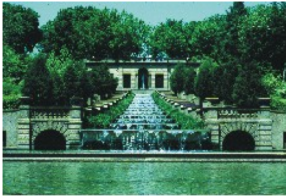
Figure 3: The cascades at Meridian Hill Park (Land Ethics, 1996)

The most enduring feature of the original design for the park were the cascades, clearly the most significant feature in the park and the one most easily identified as Italian Renaissance in influence (figure 3). However the origins of the design are much more difficult to divine. There are no documentary references to specific precedents for the version of the cascade that appears in the initial design drawings of 1913 and 1914. Since Burnap had not traveled to Italy at the time he produced the original design drawings in 1913, we must turn to the published accounts of the Renaissance gardens to provide some possibilities for the origins of the design. The most probable precedent from published sources was the cascade at St. Cloud, France, designed by Thomas Francine circa 1625. Pictured in Howard's discussion of French gardens and attributed to Le Notre, the cascade is similar in scale and form to Burnap's early drawings, with a central circular feature and a vertical terminus (Howard 1902). However, as the cascade is simplified and achieves its final form in 1920, the design can only be seen as an interpretive one, transcending imitation to apply the spirit of a Renaissance cascade to the given site. By that time Peaslee had acquired the personal experience of studying the villas, and modified the scale and form of those precedents into a cascade both larger in scale and simpler in form than his Renaissance examples.