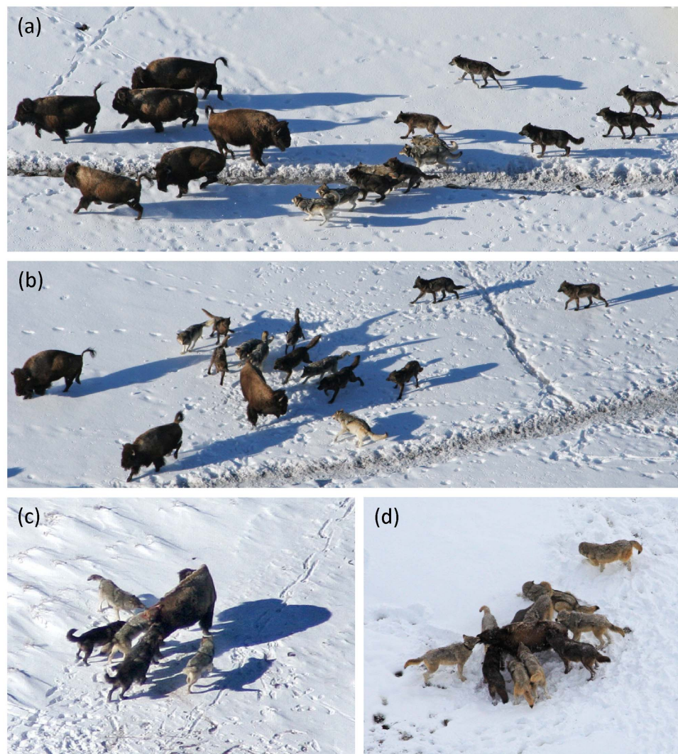
Figure 1. Behavior of wolves hunting bison: (a) approach, (b) attack-individual, (c, d) capture (see Table 1 for definitions). "Attacking" is the transition from (a) to (b), and "capturing" is the transition from (b) to (c, d). (Photo credit: Daniel Stahler, Douglas Smith). doi:10.1371/journal.pone.0112884.g001

Observations of repeated attempts to perform the same task during the same encounter were also correlated, but these were used in only models of capturing, which fitted encounter identity as a random intercept within pack. Models of attacking included only the first attempt because we were mainly interested in how group size affected the probability of attacking on first encountering bison. All models included a compound symmetric correlation structure, which assumed that all observations within