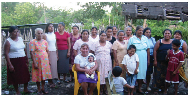
Figure 2. A women's group formed to promote collective action to improve livelihoods in Calakmul, Mexico. By becoming "farmers," the women challenged local norms concerning women's roles in the community and within families. They also gained access to financial assistance targeted to farmers.