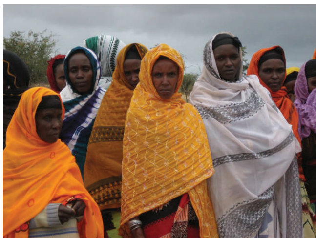
Figure 3. A women's group formed to promote collective action to improve livelihoods on the Borana Plateau, Ethiopia. See Coppock and colleagues, this issue , for details.

Other cases of collective action by women have been important in social change, as illustrated by examples from Kenya and Ethiopia (Fig. 3; see Coppock et al. , this issue ). These cases have involved shifts in gender roles at household and community levels, and women have gained access to financial and other resources, causing profound shifts in prevalent gender norms. Interestingly, in the Ethiopian case, the dynamics were set in motion by external change agents associated with a research project, rather than by internal social factors or shifts in national policies.