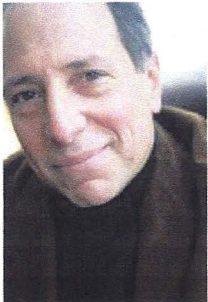
AUTHOR PHOTOGRAPH © BY SARA FRANCE

By CHARLES EBERLY, PH.D., Bowling Green State '63