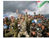
SCO soldiers hold happy get-together