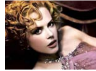
Nicole Kidman to star in horror flick remake