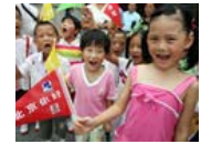
"Olympic Babies" celebrate one-year countdown