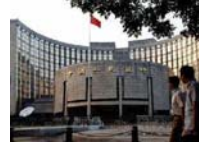
Chinese central bank warns of inflation risks in latest monetary report