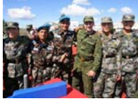
SCO members kick off anti-terror drill