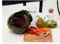
Study: diet foods may lead to child obesity