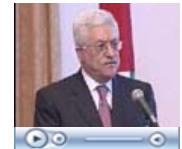
Abbas: Hamas has to restore pre-takeover conditions in Gaza

Copyright ©2003 Xinhua News Agency. All rights reserved. Reproduction in whole or in part without permission is prohibited.