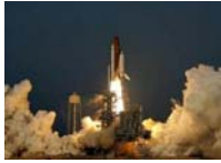
U.S. space shuttle Endeavour lifts off on first mission in 5 years