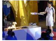
Thai princess lights flame of Universiade