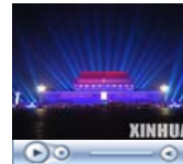
Whole nation count down for Beijing Olympic Games