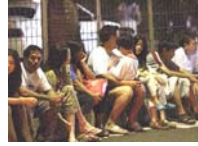
Strong earthquake hits West Java of Indonesia