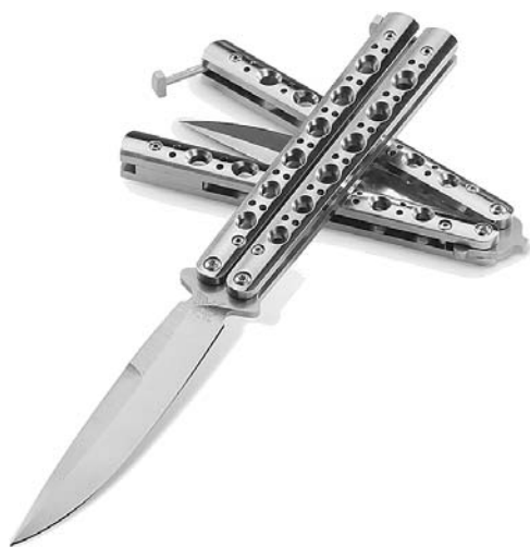
A BUTTERFLY KNIFE OPEN AND CLOSED 59

Butterfly knives, also known as balisongs, are sometimes named explicitly in state or local knife laws and are occasionally considered to fall within a state or local definition of “switchblade.” 58 A butterfly knife consists of two handle sections that, when the knife is closed, completely cover the blade.