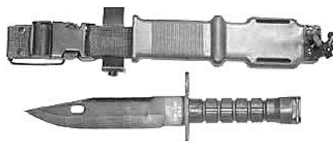
U.S. M9 BAYONET 24

Although anything with a blade can be used as an offensive or defensive arm, World War II saw the introduction of the M4 bayonet, which was specifically designed to be useful as a handheld weapon. 22 In the post-Cold War era, bayonets were designed to serve not only as fighting knives but also as wire cutters, box cutters, or improvised pry bars. 23