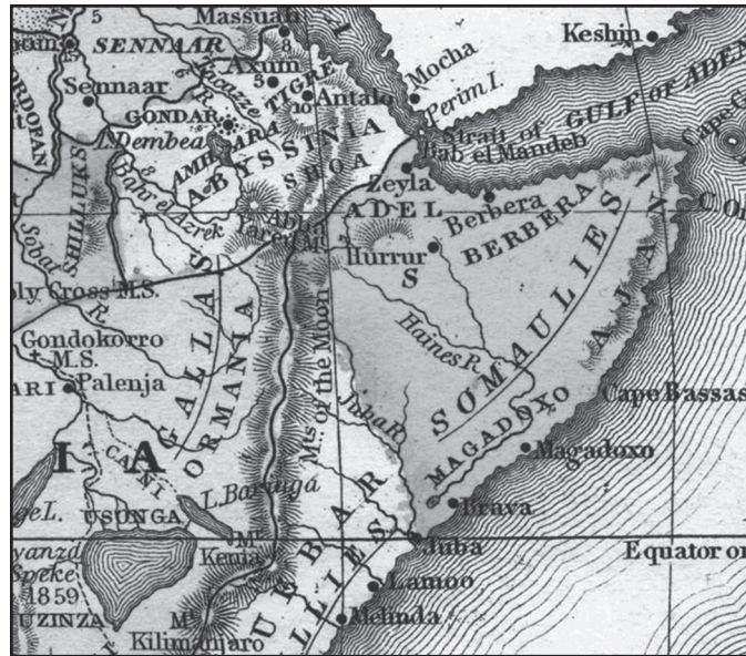
Map 1: Oromia in the 1850s